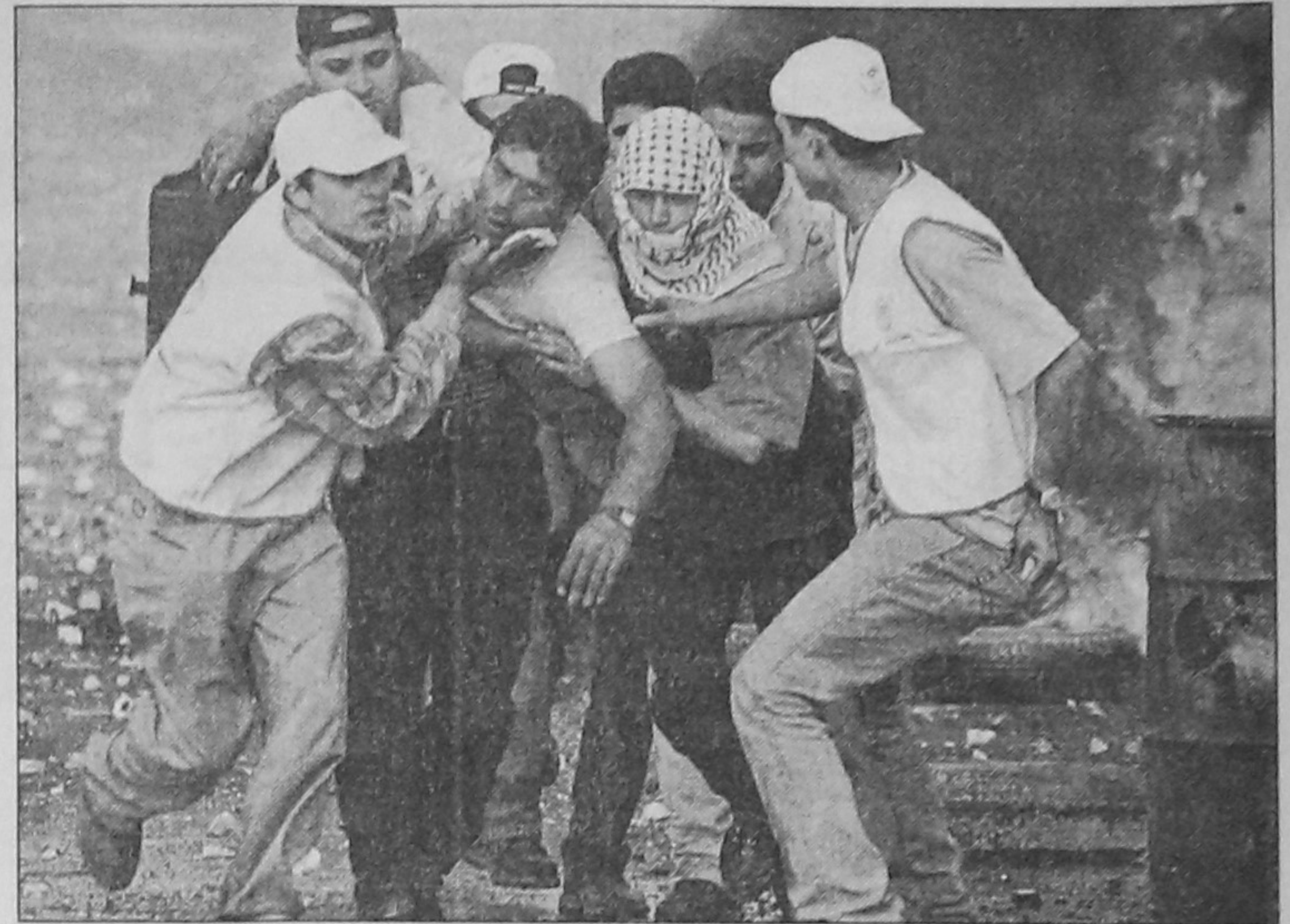
Palestinian youths evacuate a wounded demonstrator shot by Israeli troops during heavy armed clashes in the West Bank town of Ramallah on Sunday. More than 30 Palestinians have been killed and hundreds more wounded in four days of clashes between Israeli soldiers and Palestinians.

"negative repercussions" for the peace process. The violence continued despite Prime Minister Ehud Barak's call for Arafat to intervene personally and a meeting overnight between Israeli and Palestinian security officials aimed at restoring calm to the region. "Unfortunately I cannot see that it (the meeting) had any effect," said Giora Eiland, head of the Israeli army's operations directorate. The Palestinian Authority Sunday called on Israel to "cease fire immediately," but a spokesman for Barak said Israel would only do so if the Palestinians did likewise. However, he said the two sides were in contact, and that Barak had spoken to US President Bill Clinton and Spanish Prime Minister Jose Maria Aznar who were attempting to mediate. Sharon, whose visit set off the wave of clashes and who is blamed by the Palestinians for the massacre of hundreds of refugees in Lebanon 18 years ago, rejected any responsibility.