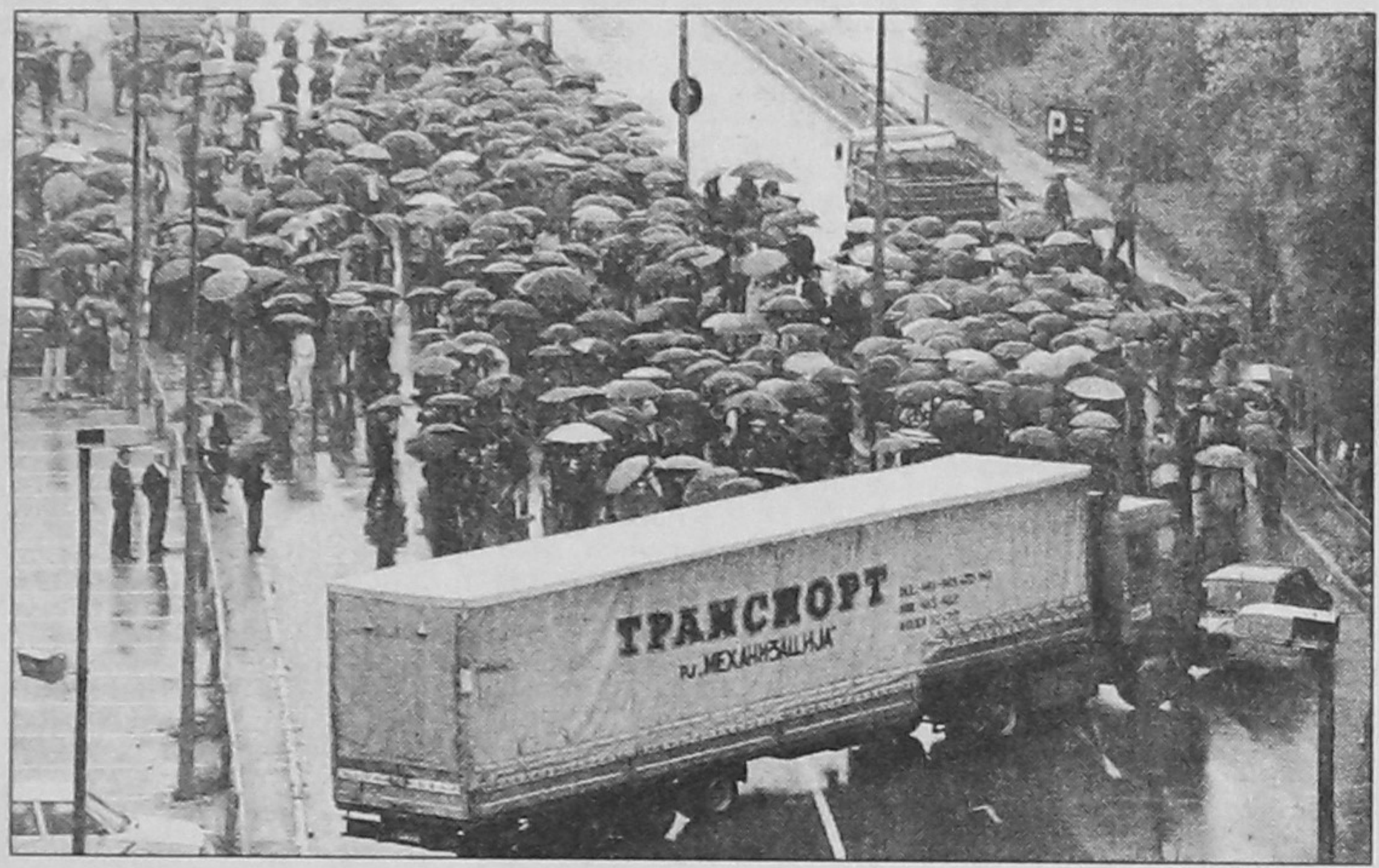
A long articulated lorry blocks access to and from the main Belgrade-Podgorica highway at the Uzice intersection yesterday while hundreds watch the blockade. They were taking part in the opposition call for a campaign of mass disobedience in response to the Federal Electoral Commission's failure to recognise the victory of the presidential candidate Vojislav Kostunica.

Murshidabad, where flood waters had covered the 'ghats' where bodies are normally cremated. "State relief workers found over 100 bodies in Bhagabangola village in Murshidabad district. It is a problem to cremate these bodies as all the ghats are under water. We are very worried about the spread of disease," Bhattacharya said. The government is worried that marooned villagers are being forced to drink contaminated flood waters, thus exacerbating the risk of water-borne disease. Thousands of people were still crowding highways and elevated railway tracks to escape the flood waters, while hundreds of others had crammed themselves precariously onto wooden boats, said relief workers.