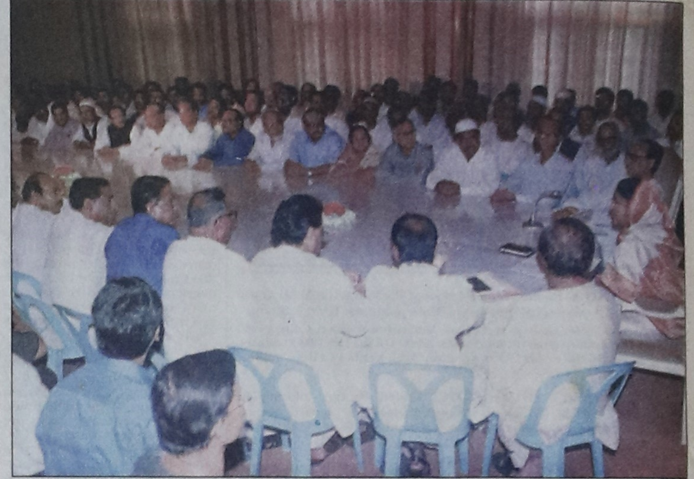
Prime Minister Sheikh Hasina held a meeting with the leaders of Sylhet district Awami League at Ganohaban yesterday. The meeting was called to end internal feud in the district unit.