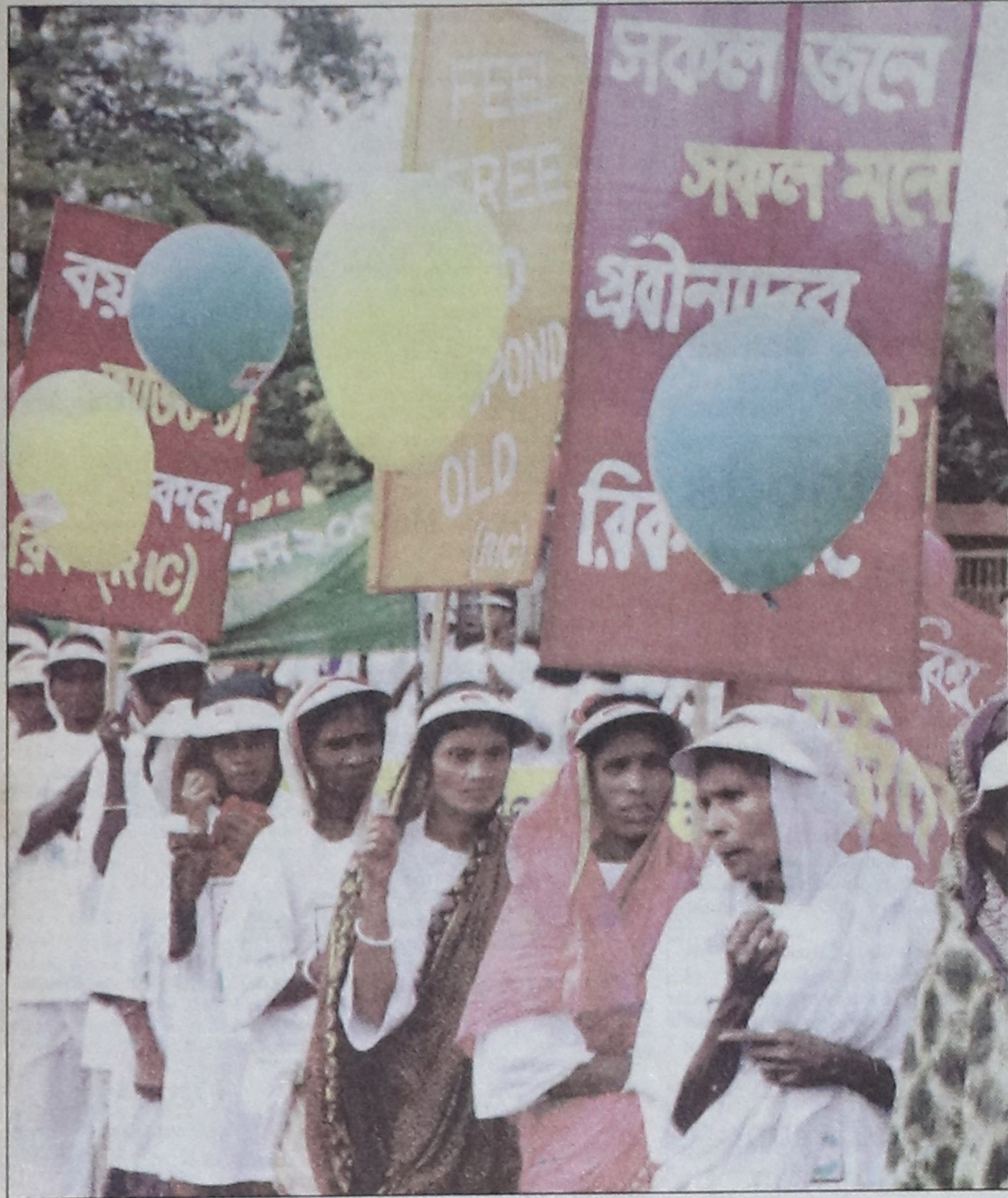
Elderly people carrying placards and banners took out a procession in the city yesterday to mark the International Day for Older Persons. The procession was organised by Resource Integration Centre (RIC).