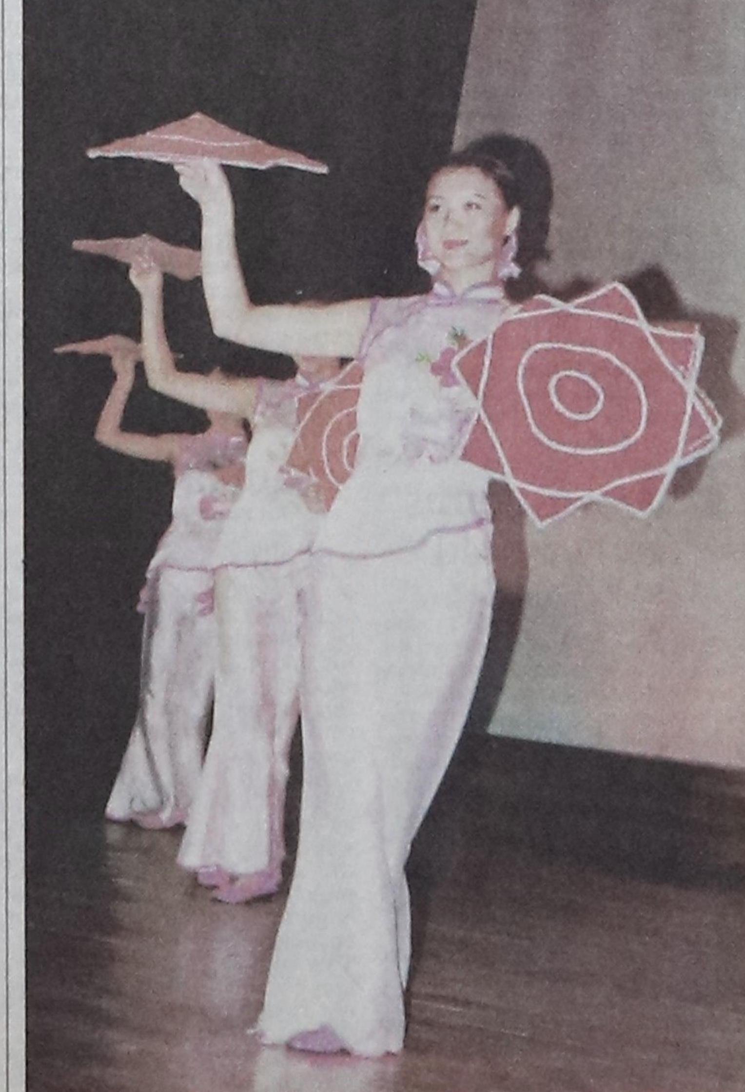
The visiting China Heilongjiang Art Troupe performing at the opening show of a three-day cultural programme organised by Bangladesh Shilpakala Academy at National Museum Auditorium yesterday.