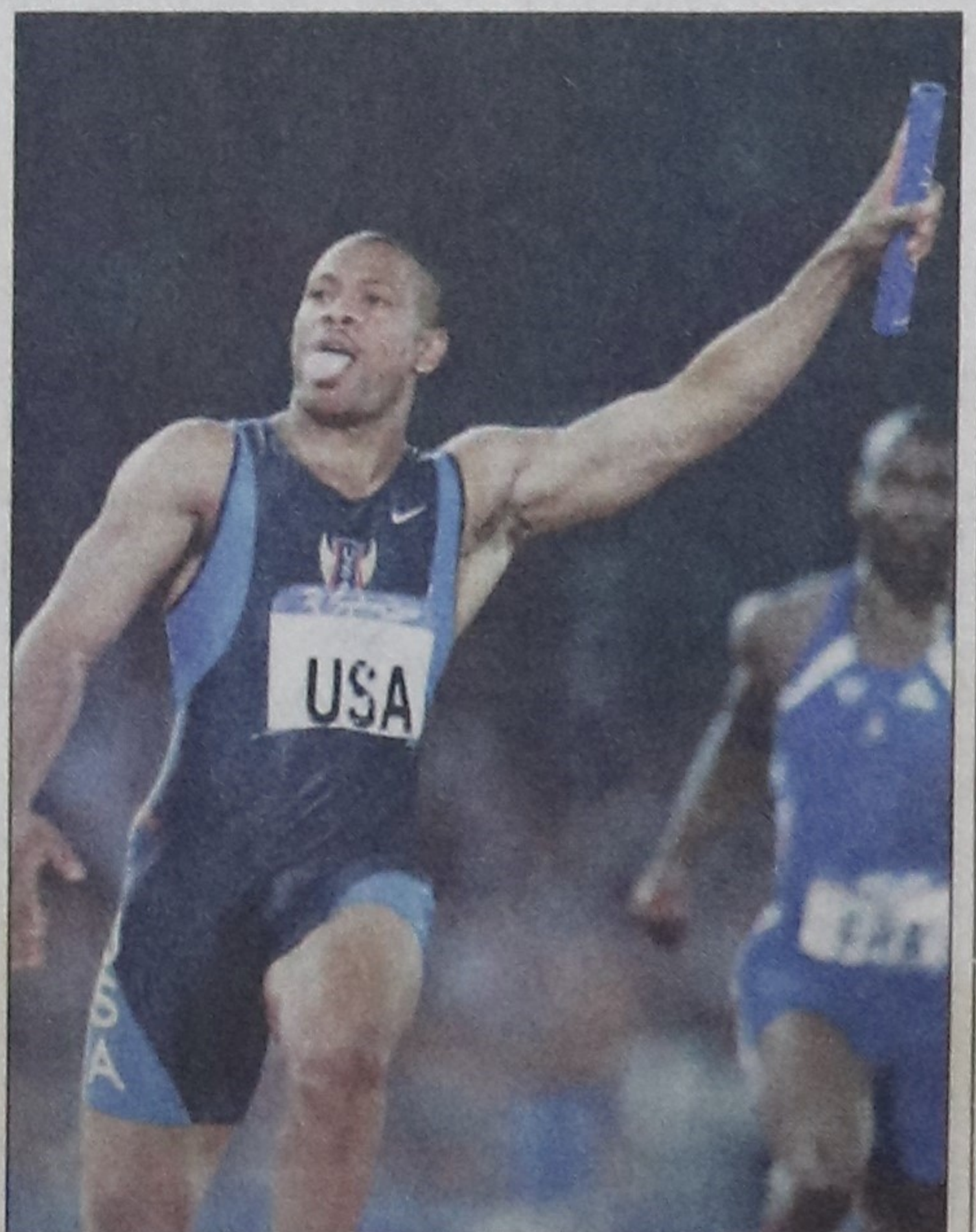
AS FAST AS THEY GET: Maurice Greene finishes the 4x100 metres relay for the gold medal winning US quartet yesterday.