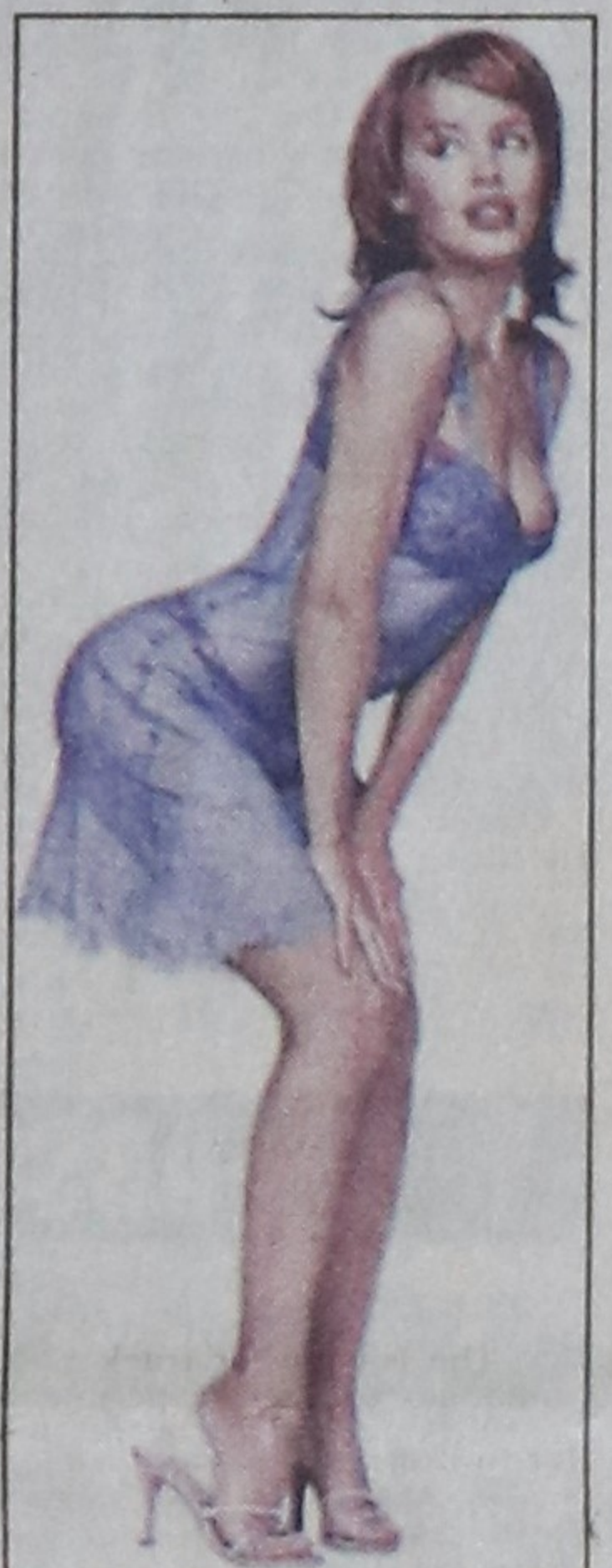
Hearts Racing for the Kylie Experience