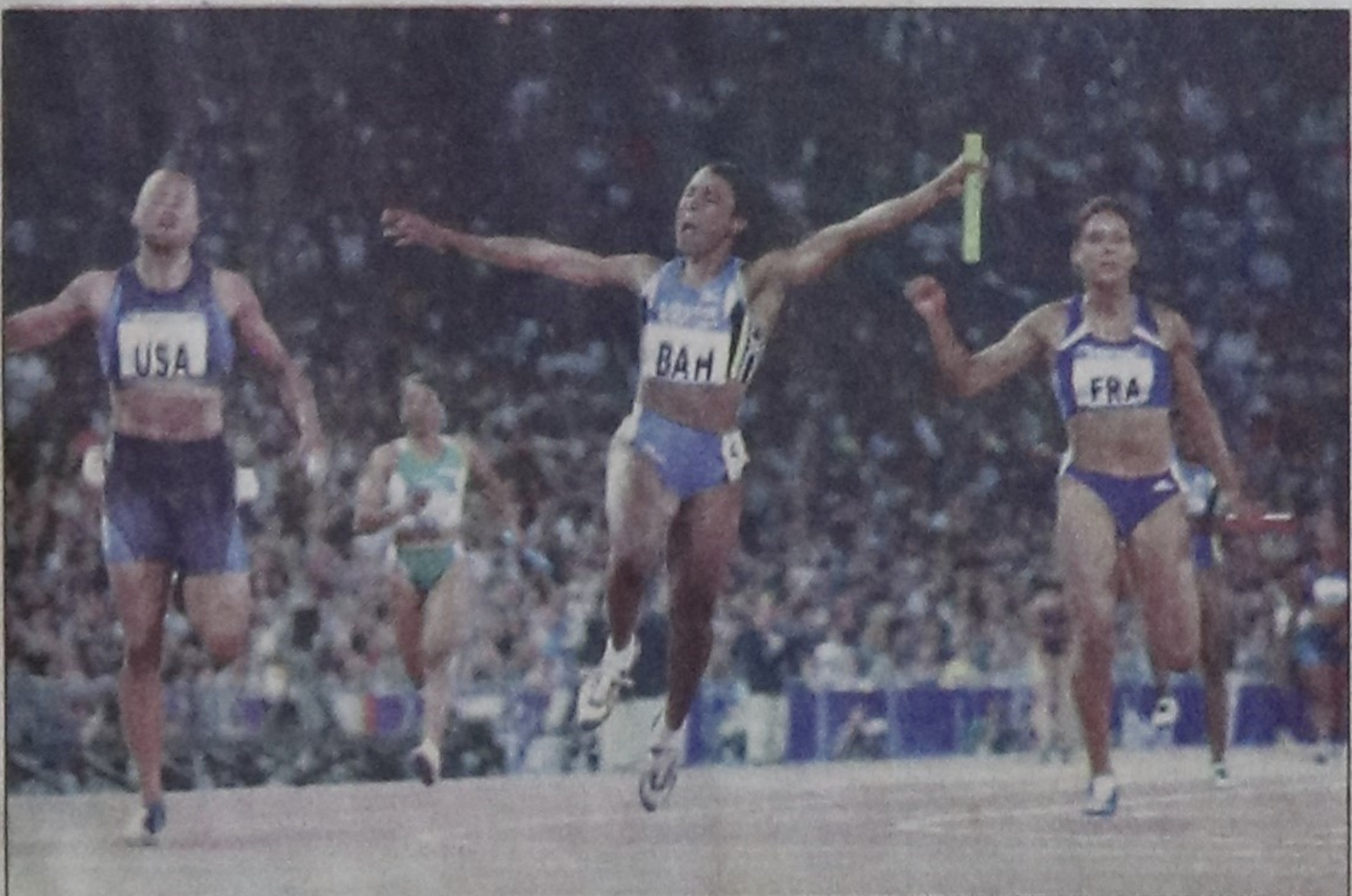
BAHAMA BLITZ: Bahama's Debbie Ferguson (C) is ecstatic after crossing the finish line ahead of Christine Arron of France (R) and Marion Jones of the US to give her team the Olympic gold in the women's 4x100m relay final yesterday.

Disappointments have been few and far between save an embarrassing exit in the 200m 1992 Olympic semi-finals and pulling up injured in his bitter duel with 100m Olympic champion Donovan Bailey, who accused him of being a chicken.