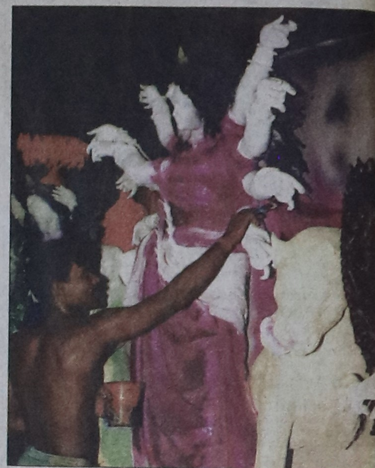
An artist putting final touch on the idol of Durga at Sankhar Bazar in old part of the city yesterday. Durga Puja, the biggest religious festival of Hindus begins on October 3.

Besides, the association will organise teachers' rallies at divisional headquarters by January 30.