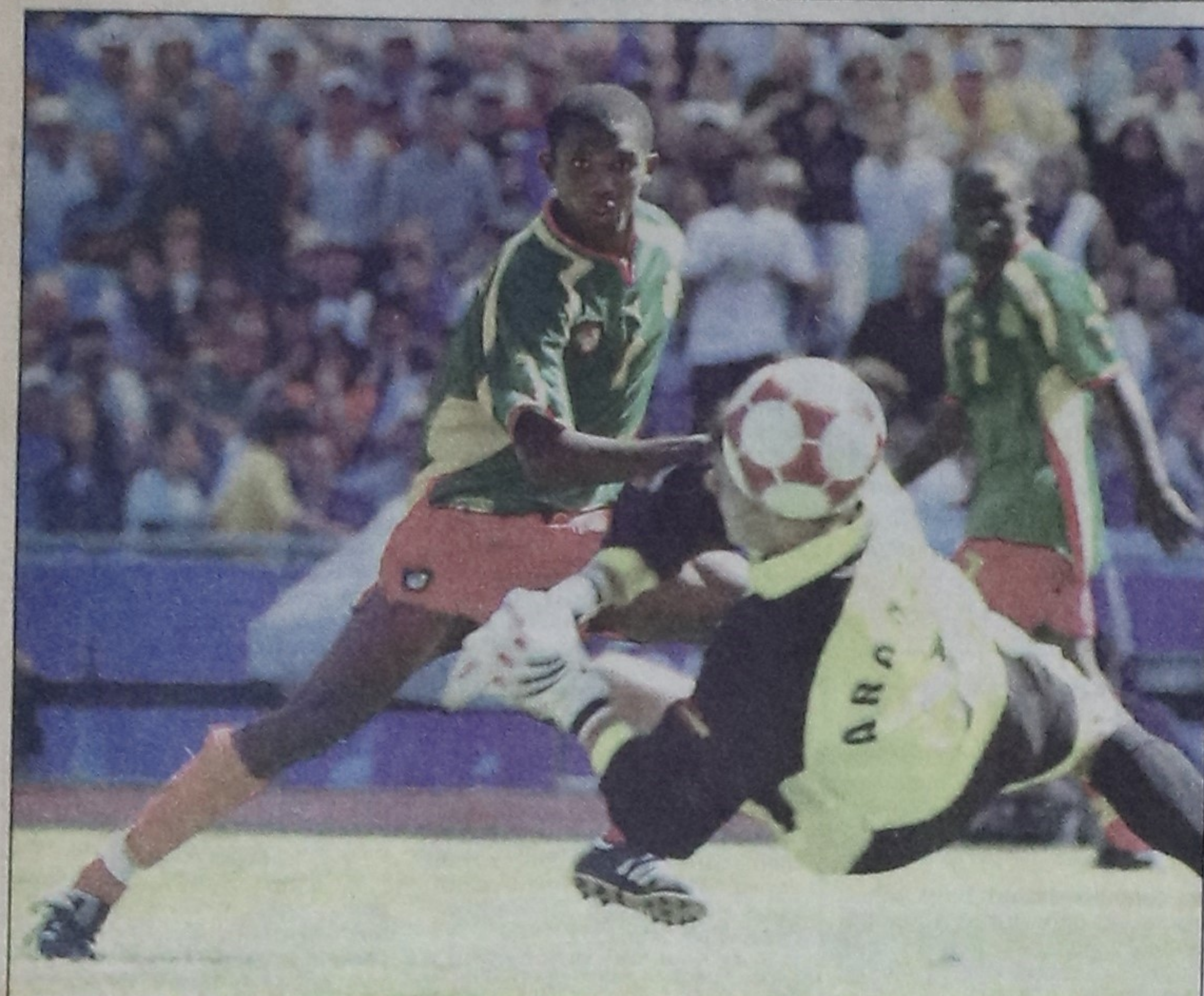
Cameroon's Samuel Eto'o Fils scores during the soccer final at Sydney Olympic games yesterday. Cameroon won the gold medal beating Spain 5-3 in a penalty shoot-out.