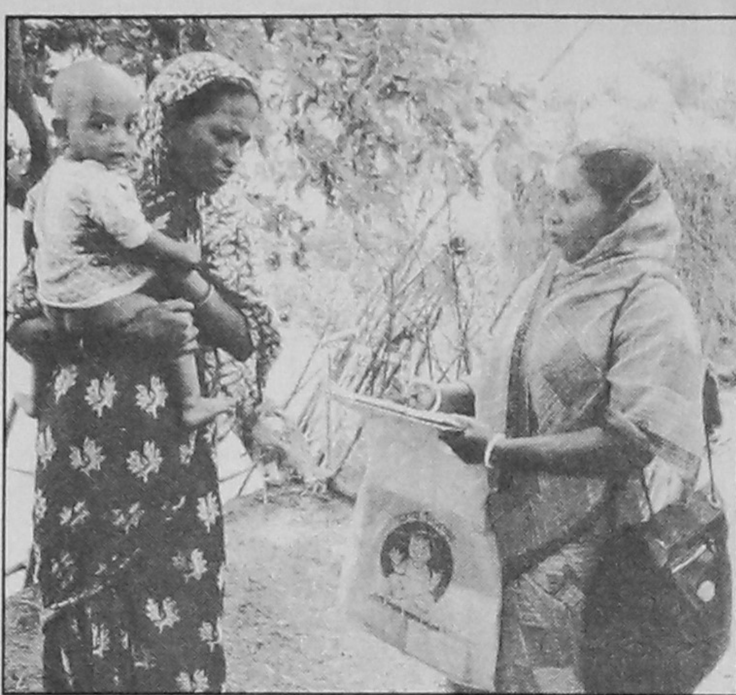
A special campaign was launched in Kishoreganj recently to register birth of all children under five years. Photo shows one woman worker collecting data in the haor area.

affected people in nine upazilas and six municipal areas. Local Awami League, BNP, Jatiya Party and Jamat-e-Islami and a few social organisations have started relief works.