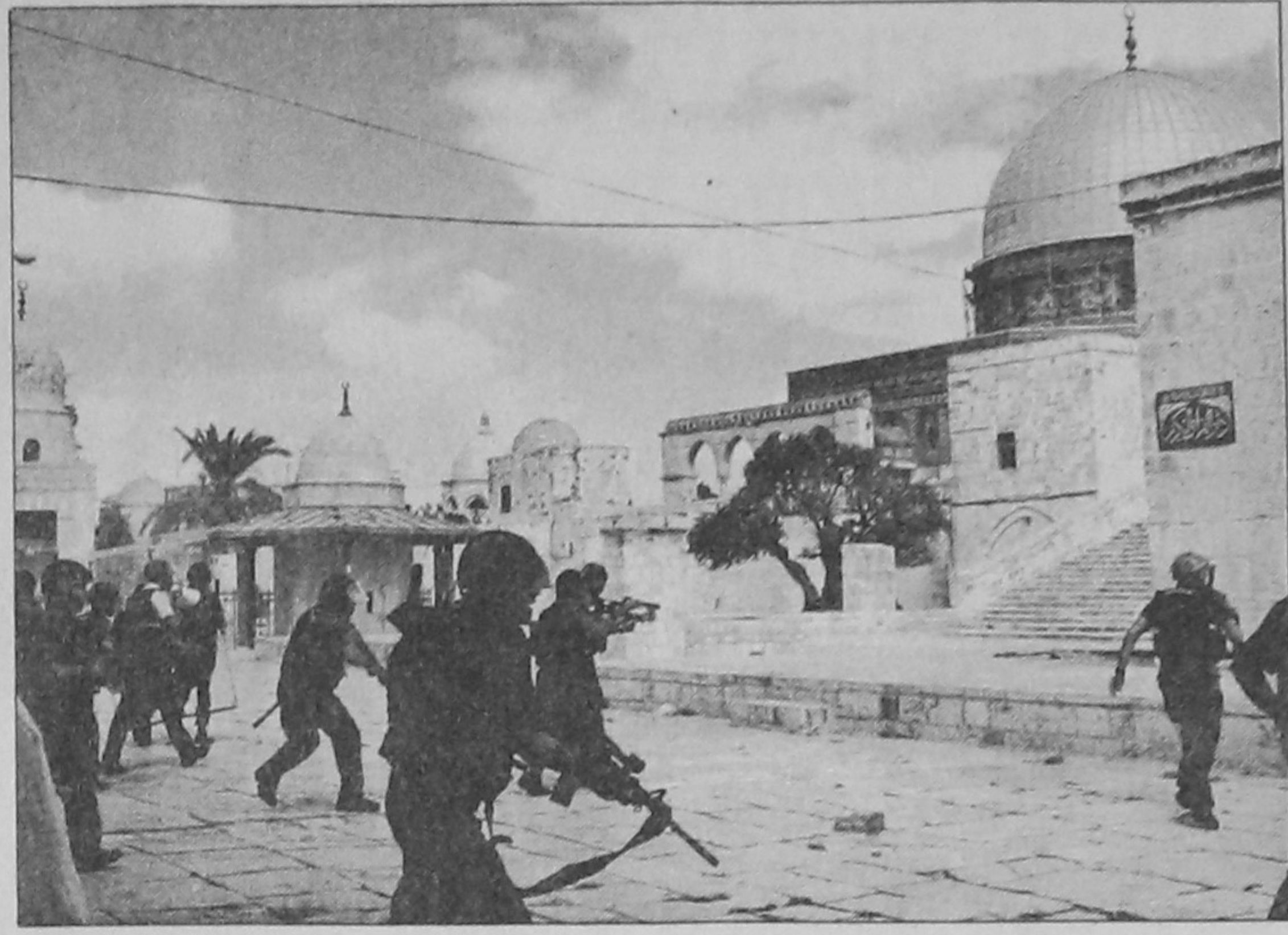
Israeli riot police take position inside the Al-Aqsa Mosque compound during clashes with Palestinians on Friday in Jerusalem. Seven Palestinians died of their wounds and more than 200 were injured in the clashes.

"The situation in Palestine is extremely grave," he added, referring to clashes with Israeli security forces this week that have left eight Palestinians dead and hundreds injured.