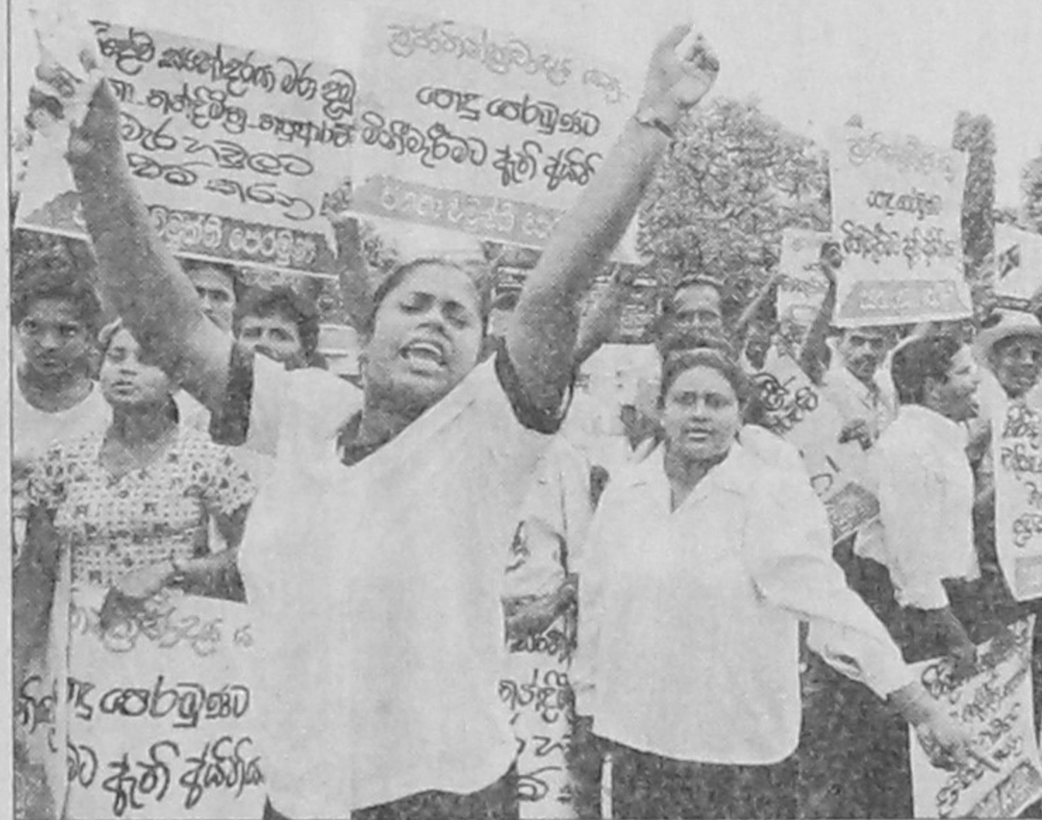
Activists of the Marxist JVP, or People's Liberation Front, demonstrated in the Sri Lankan capital of Colombo yesterday denouncing the police killing of one of their supporters earlier in the week. At least 10 people have been killed in polls-related violence in the run up to the October 10 parliamentary elections.