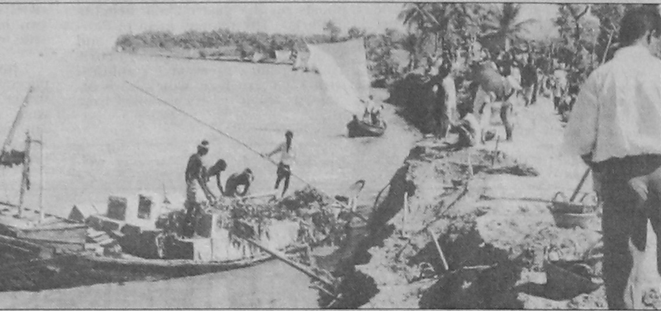
Workers dump concrete blocks at Taskerkandi in Chandpur to save the area from erosion by the Meghna. The erosion is threatening Chandpur Irrigation Project.

CIP covers Chandpur Sadar, Faridganj and Haimchar upazilas of Chandpur district and Rajpur, Ramganj and Sadar upazilas of Laximpur district.