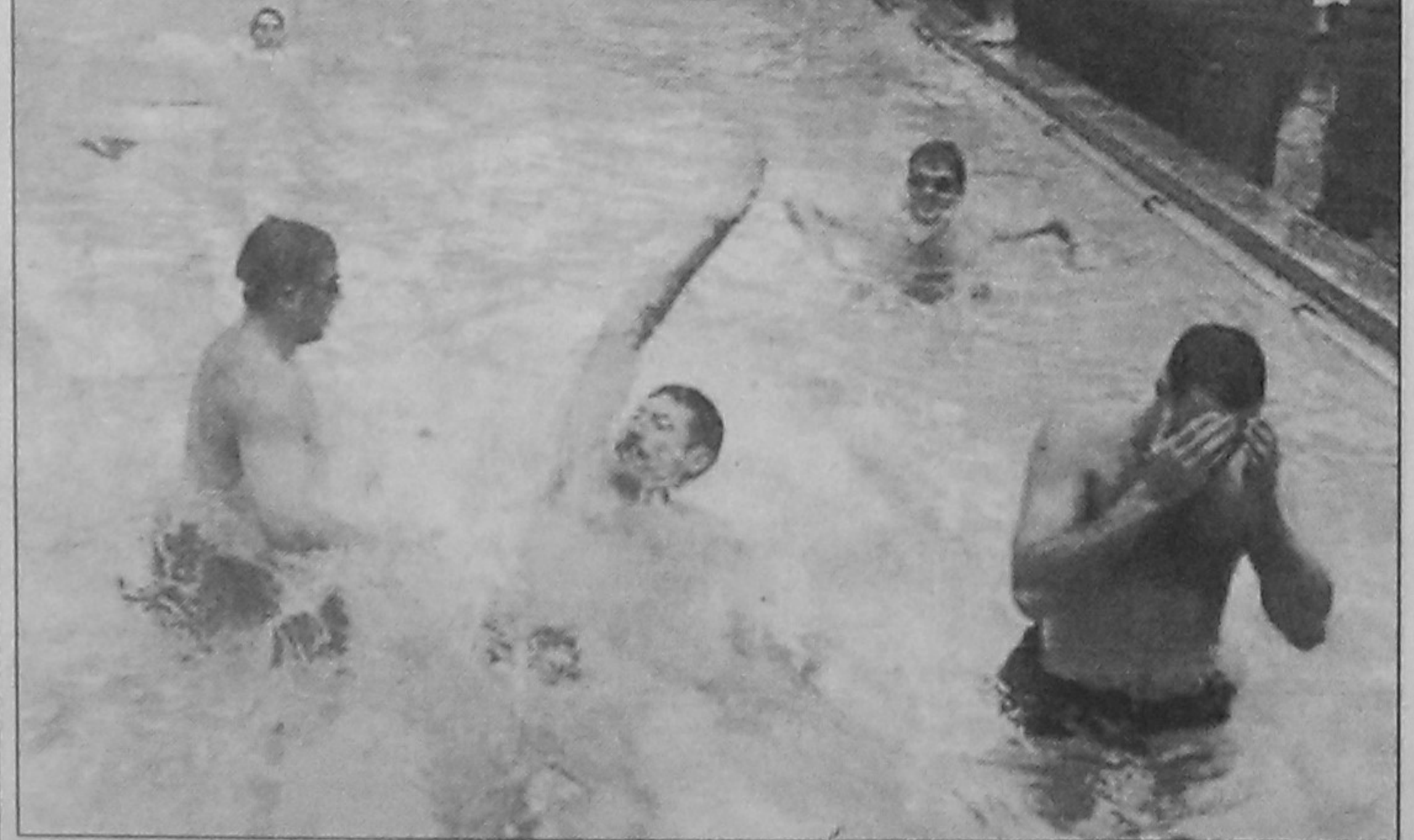
Australian cricket stars relax in the swimming pool of their hotel in Nairobi on September 27. The Aussies arrived in the Kenyan capital earlier on that day to participate in the October 3-15 ICC Knockout tournament.