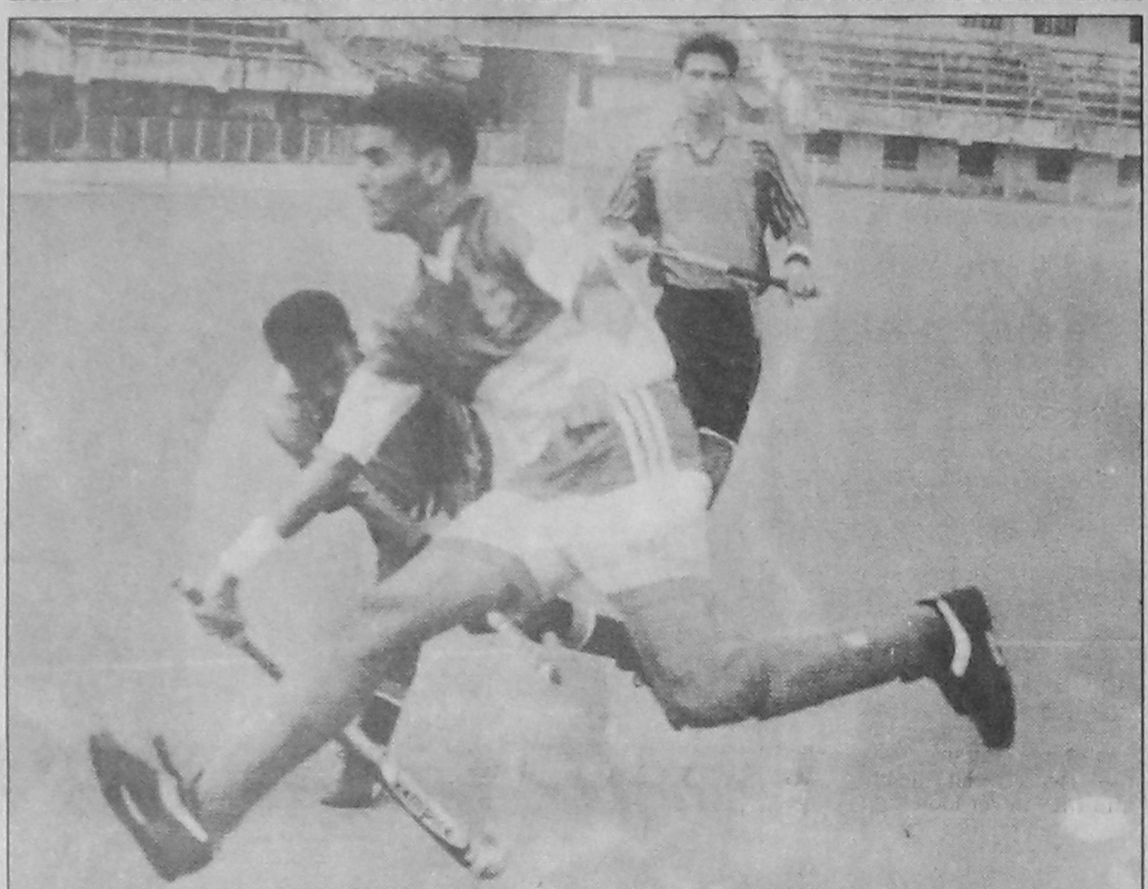
Action from yesterday's Green Delta Premier Division Hockey League between Ajax and Mariner Young's at the Maulana Bhasani National Stadium. The match ended 1-1.

Next match: Against Sri Lanka on October 1