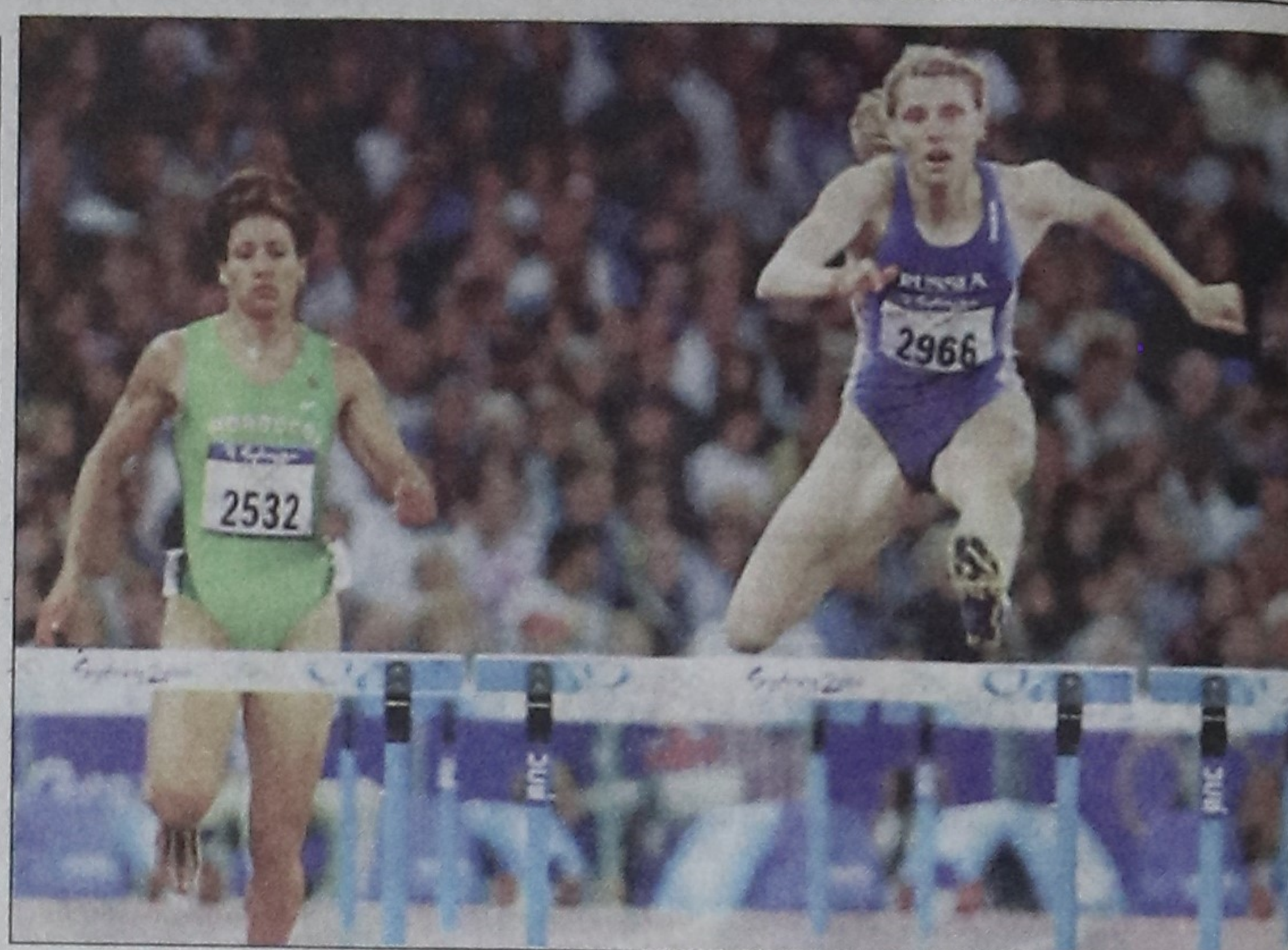
Irina Privalova of Russia (R) clears a hurdle in the women's 400m hurdles final of the Sydney Olympic Games to win the gold yesterday.