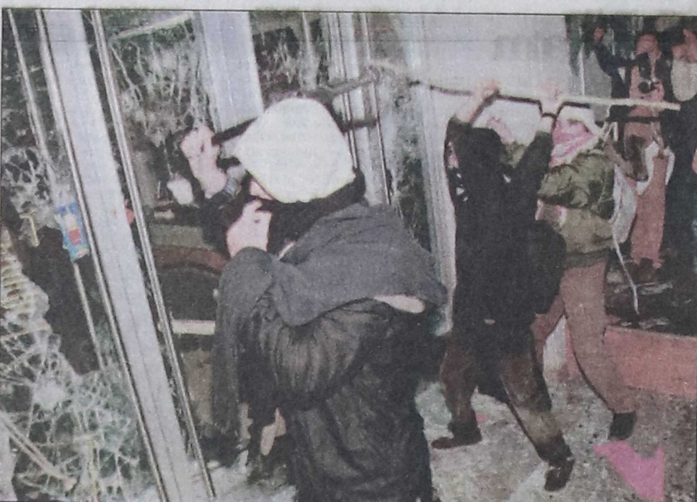
Demonstrators break the windows of the McDonald's fast food restaurant on Wenceslas Square in Prague as violent demonstrations against the IMF and the World Bank continued there yesterday.

Scuffle with cops on: IMF, WB delegates besieged