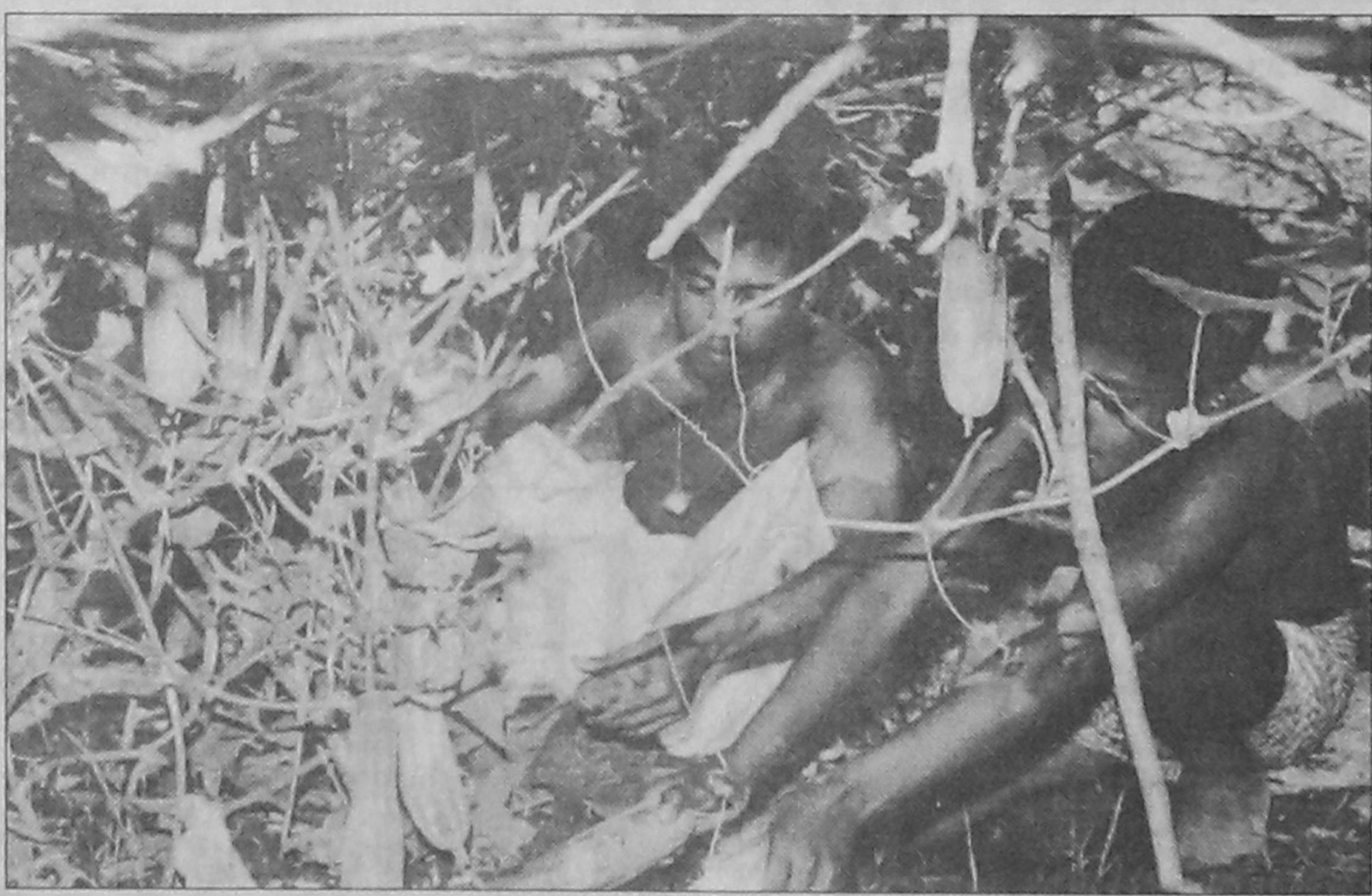
Two teenagers work at a cucumber garden at village Bela Pingalhati in Jamalpur district. Cucumber cultivation has gained popularity in the district in recent days. The popular vegetable sells between Tk 8 and Tk 10 a kg in local markets. Some 40 acres of land in the village have been brought under the farming this season.

A survey team recently visited Raipur, Palash and Shibpur upazilas and came to know guava is one of the cash crops of the area.