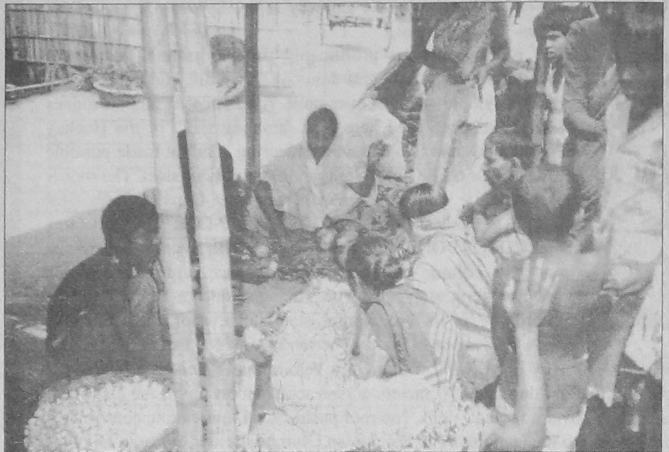
It is a bazaar with a difference. All buyers and sellers are women in the Bou-bazaar in Sirajganj town. However, some males are also seen in these days.

The buyers have also demanded attention of the municipality authorities in maintaining cleanliness and sanitation in the market. Some locals, however, have demanded that the market should have permanent sheds.