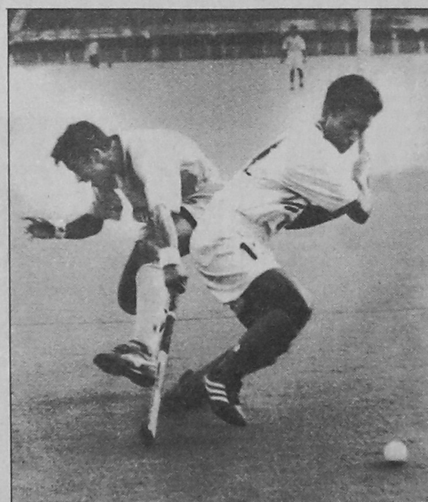
Scene from yesterday's Green Delta Premier Division Hockey League engagement between Abahani and Usha at the Maulana Bhasani National Stadium.