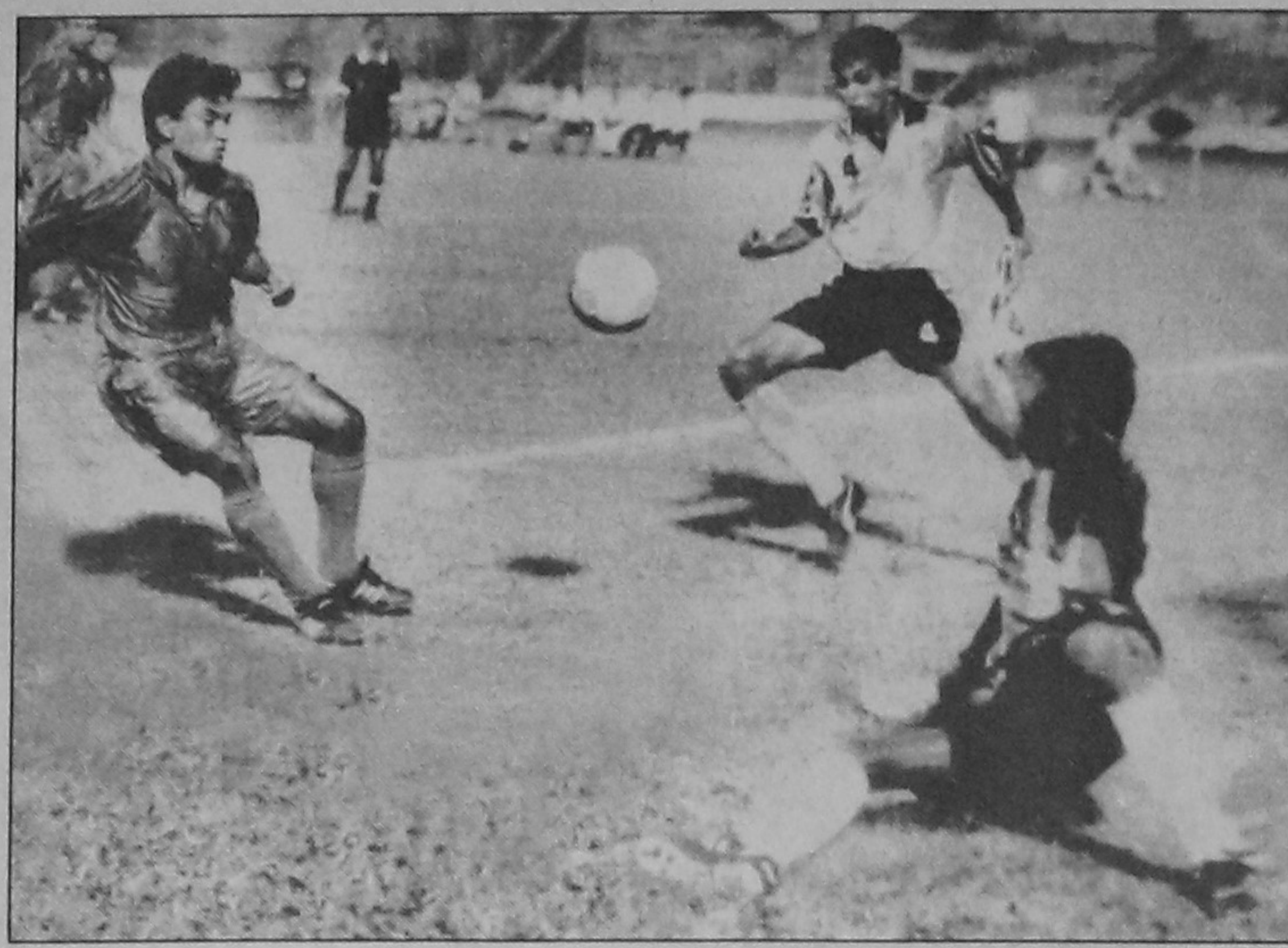
Goalmouth action during the National Bank Premier Division Football League encounter between Brothers Union and Dhanmondi at the Bangabandhu National Stadium yesterday.