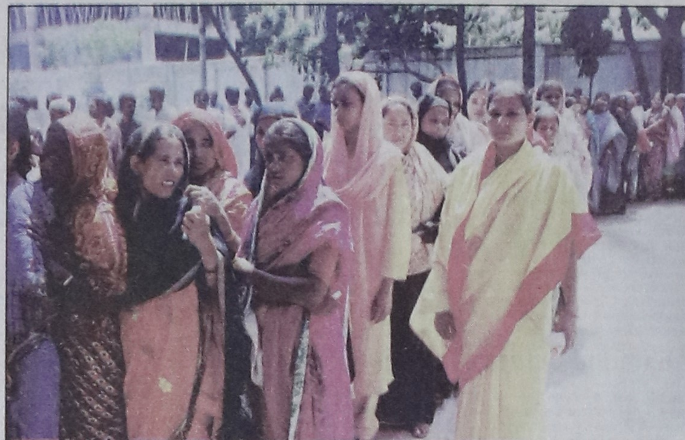
Voters queue up to cast their ballots at Ashraf Jute Mill High School centre during Tongi municipality election. Election was held in 12 municipalities yesterday.