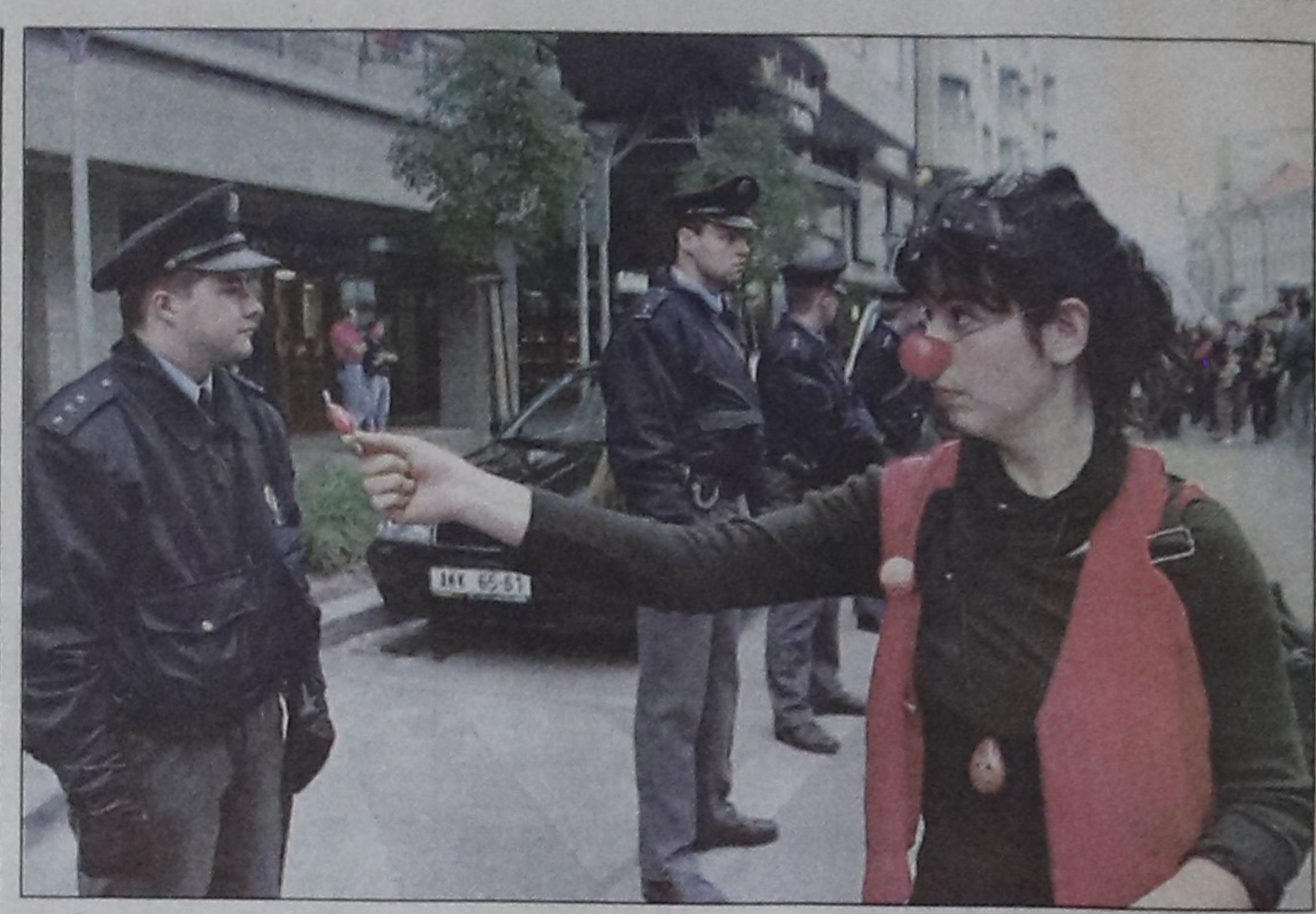
A demonstrator offers a candy to a Czech policeman as they try to block the entrance of Prague's Marriott hotel in the center of Prague yesterday. Hundreds of demonstrators laid siege to several hotels where delegates of the International Monetary Fund (IMF) and the World Bank Group are staying.

Five people died on the spot and two died on way to the hospital. The driver of the bus died at the Savar CMH while a