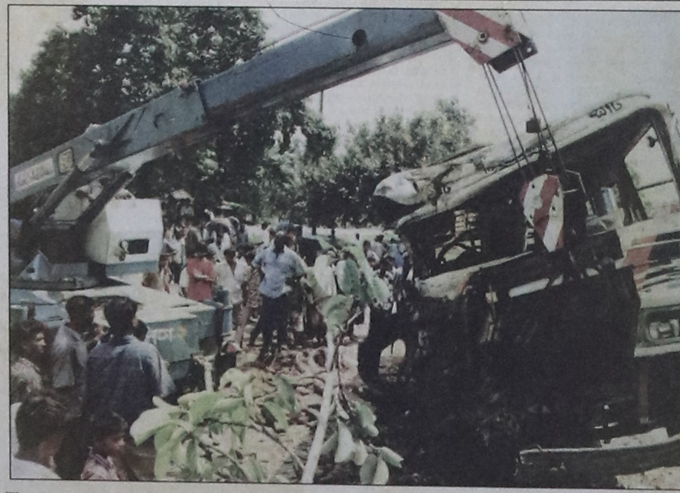
The damaged bus being removed by crane from the road in front of Jahangirnagar University yesterday. The bus collided with a truck, killing nine.