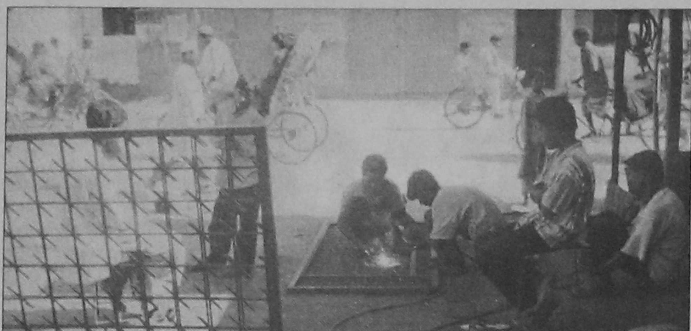
One of many unauthorised welding factories of Tangail town stretches its activities on the public thoroughfare. Oblivion to sufferings of the pedestrians and other road users, the municipal authorities also ignore that exposure to welding sparks could cause permanent damage to eyes and other human organs. These young men keep working on the road without any protection whatsoever. Is there any one to warn them?