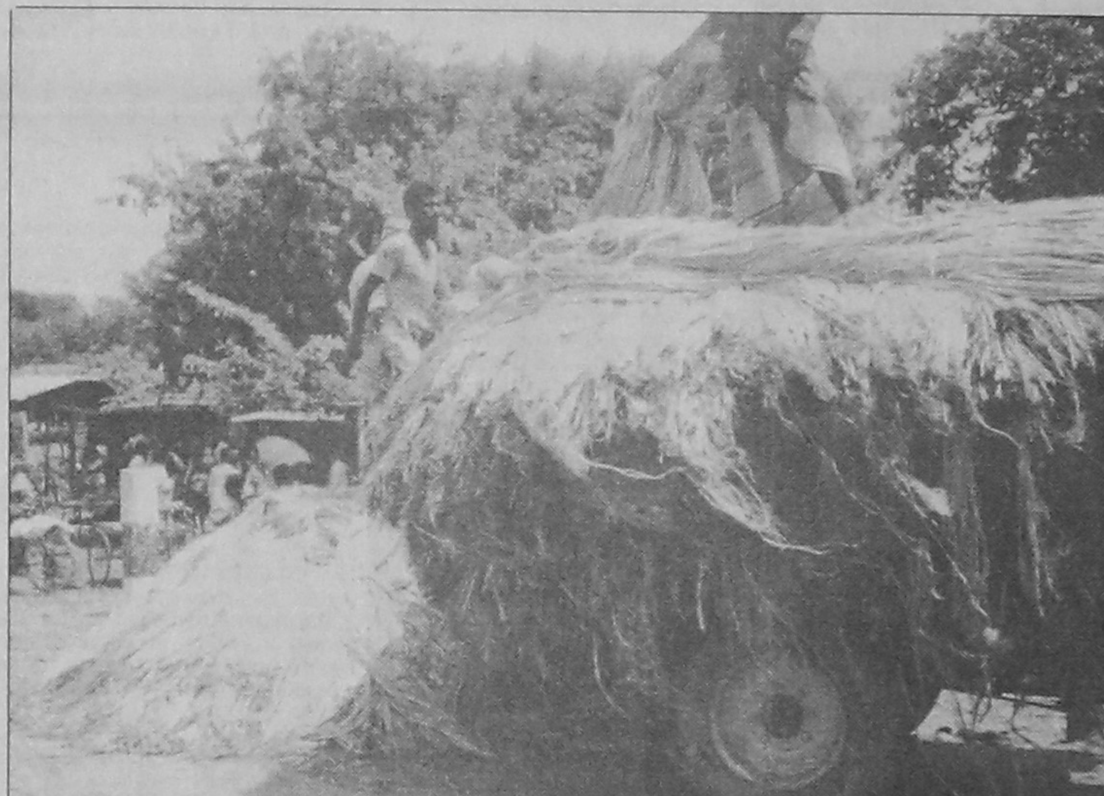
Farmers display jute at Bonpara bazaar in Natore. The once golden fibre now sells below production cost, much to the frustration of growers.

The man, Al Kayesh, 27, was an electrician. An unnatural death case was registered with the Sapahar police.