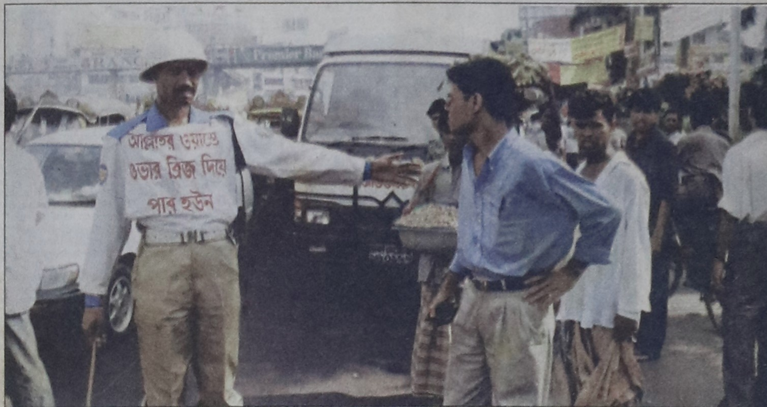
Divine intervention, the last resort? Having failed to infuse enough civic sense into the pedestrians to get them to use overbridges for crossing road, a traffic constable in desperation wears a banner that reads "For Allah's sake, use the over-bridge," at Farmgate in the city yesterday.