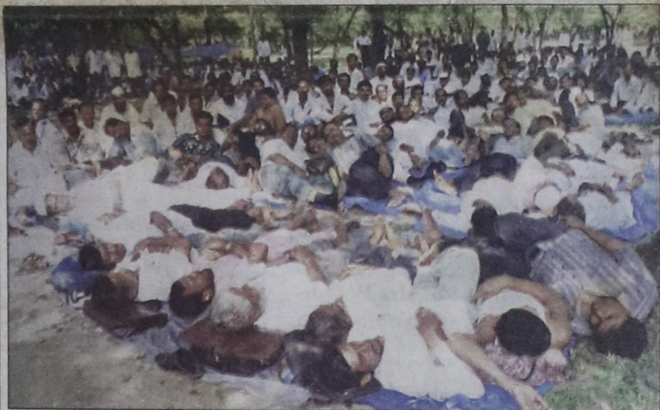
Non-government primary school teachers continued their sit-in at Osmani Udyan in the city for the second day yesterday. The teachers have been boycotting classes since September 2 demanding nationalisation of their service.