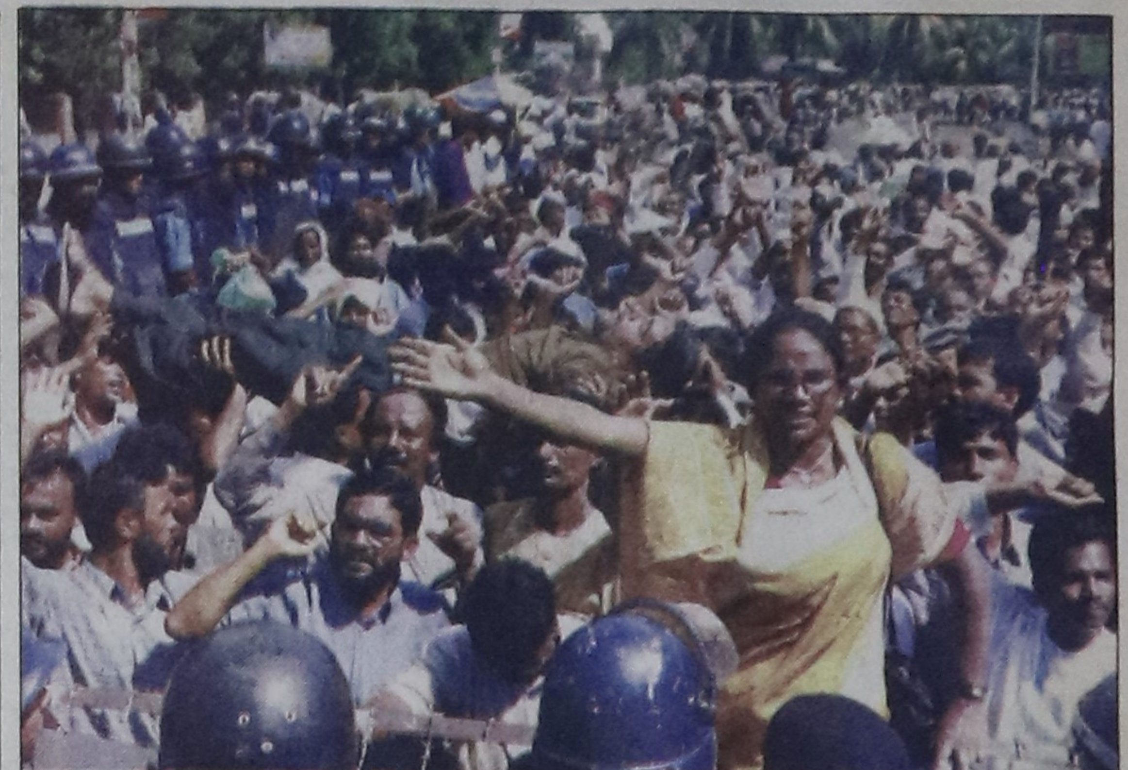
Police put up barricades in front of Shishu Park to stop the agitating non-government primary school teachers from advancing towards the prime minister's office after holding a rally at Osmani Udyan. The teachers had planned to lay a siege to the Prime Minister's office to press their demand. One of the teachers fainted in the scorching heat of the sun.

During their visit, they will also hold another meeting of officials and exporters' representatives.