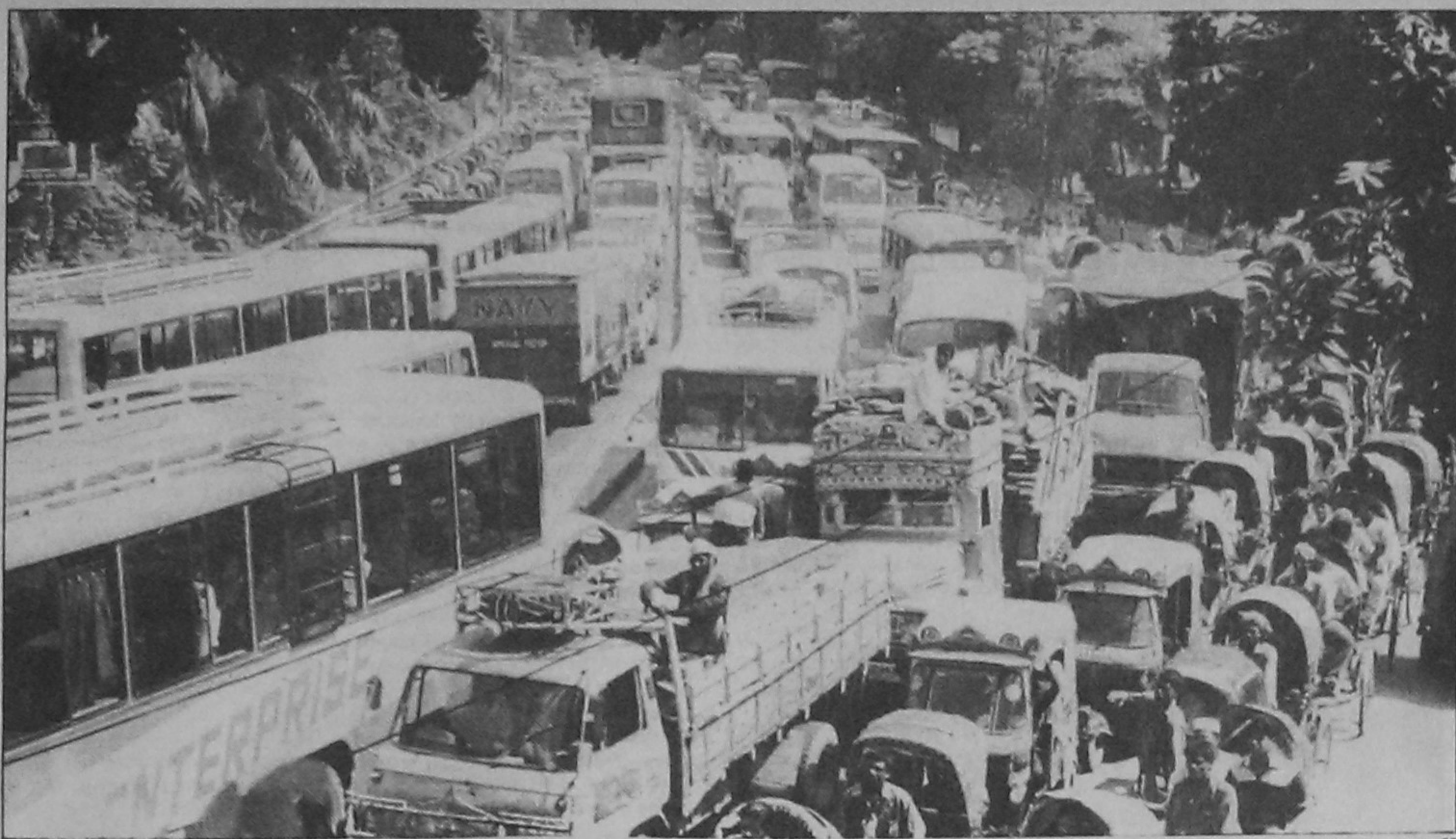
Traffic movement on the road from Engineers' Institute to Shahbagh intersection came to a halt for a long time due to traffic congestion yesterday. The problem is getting worse day by day.