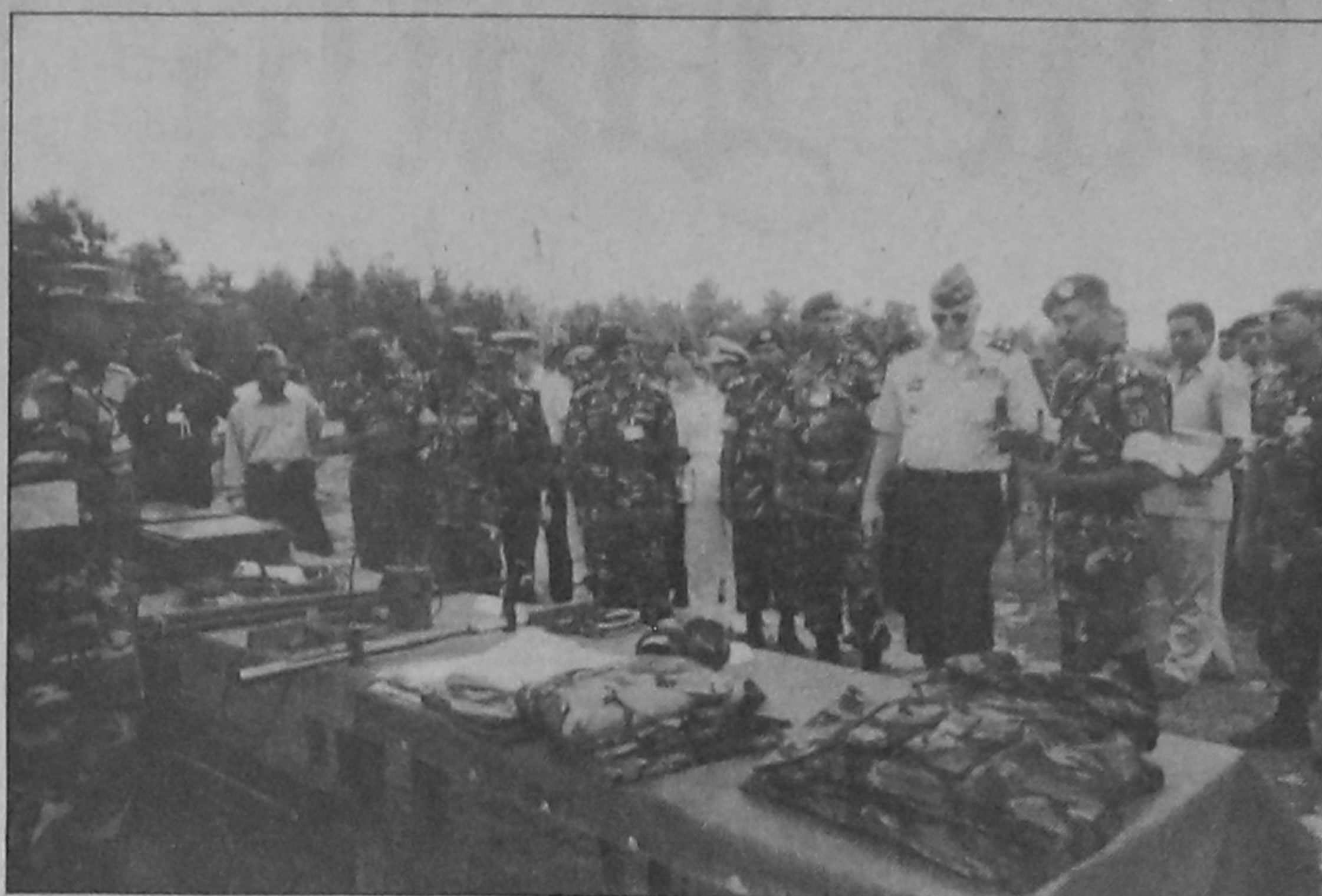
The participants of the South Asia Peacekeeping Operation Gaming Seminar visited the Peacekeeping Operation Training Centre (PKOTC) at Rajendrapur yesterday.

Rotarians have been requested to attend the meeting on time.