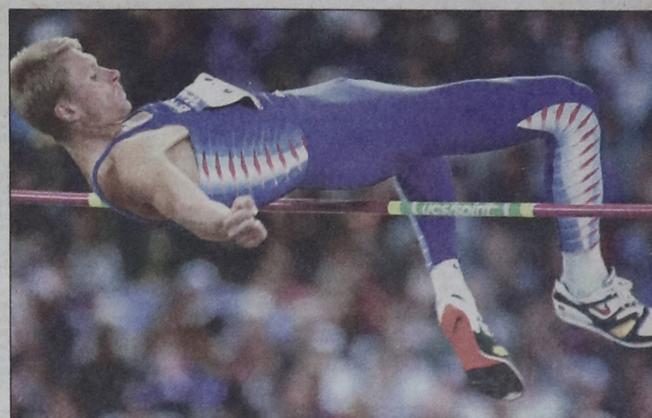
Sergey Kliugin of Russia clears the bar yesterday in the men's high jump final of the Sydney Olympic Games. World record holder Javier Sotomayor's controversial comeback ended in heartbreak as Kliugin sneaked the Olympic high jump gold.

Meanwhile, Bayezid thana police in a raid arrested one Md Ismail -- an absconding accused in three criminal cases -- from Sherahah Colony last night.