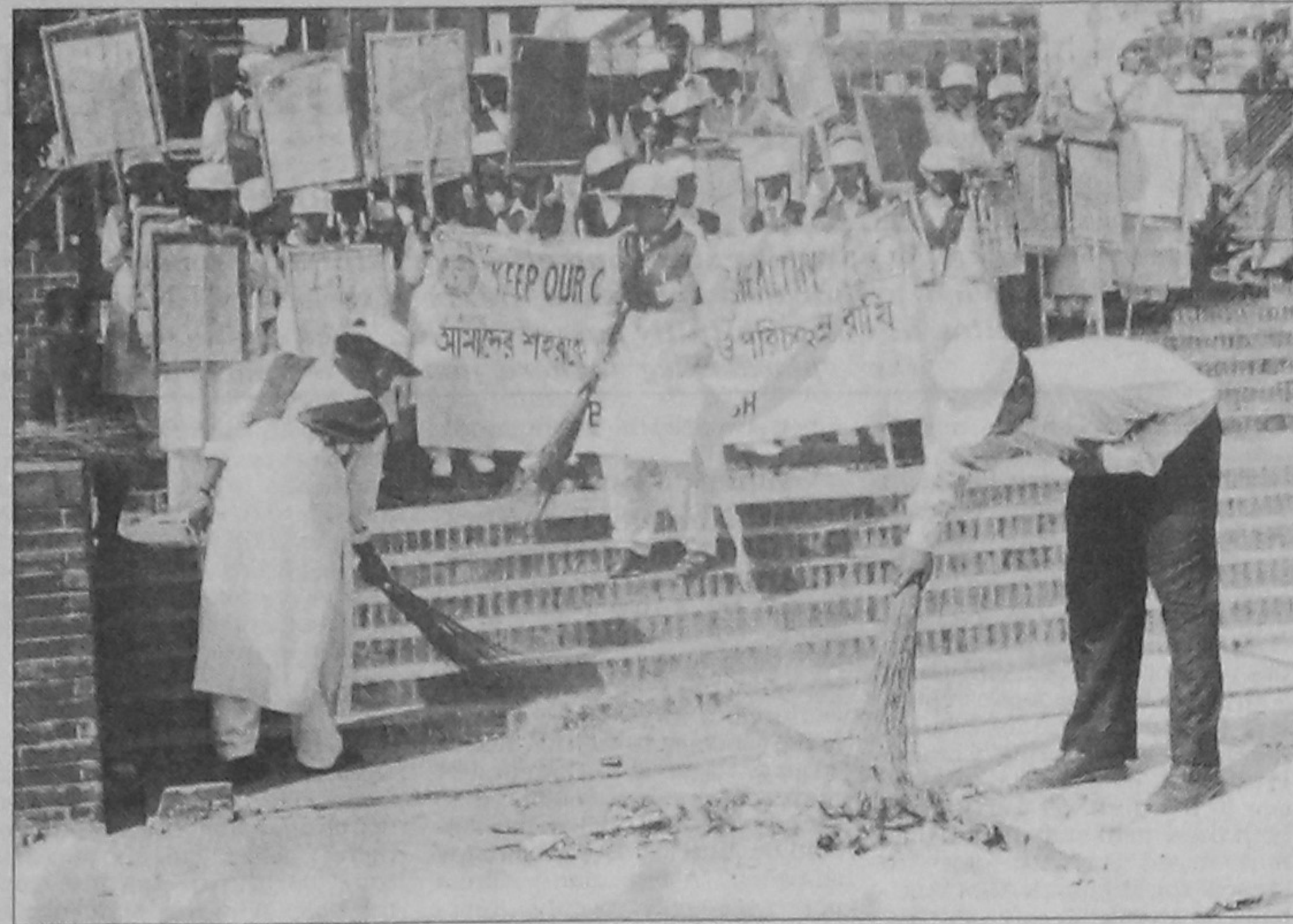
Girls guide and Green Club members of different city schools and colleges participated in Environment and Social Development Organisation's (ESDO) cleaning programme "Keep Our City Clean and Healthy". Picture shows some of the students at the Dhanmondi Lake area where the cleaning drive was carried out yesterday.