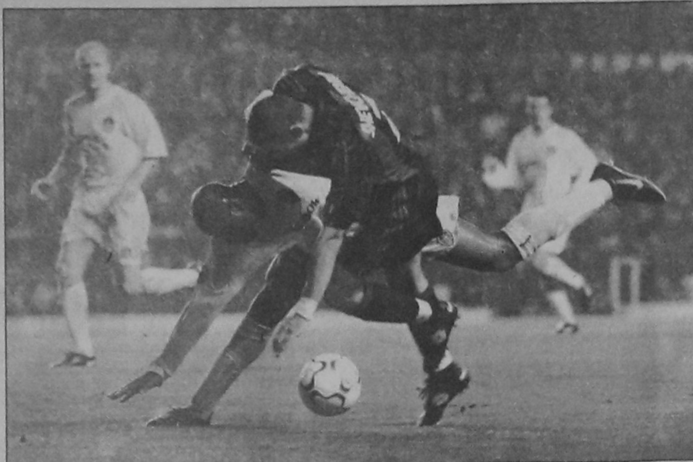
AC Milan striker Andriy Shevchenko (top) and Michael Duberry of Leeds United find themselves in an awkward position while in pursuit of the ball during their European Champions' League fixture at Leeds on September 19.

The 25-year-old was pictured in gold paint on the Olympic preview issue of Sports Illustrated, but he qualified a disappointing 11th and his medal dreams now depend on apparatus finals in rings and parallel bars.