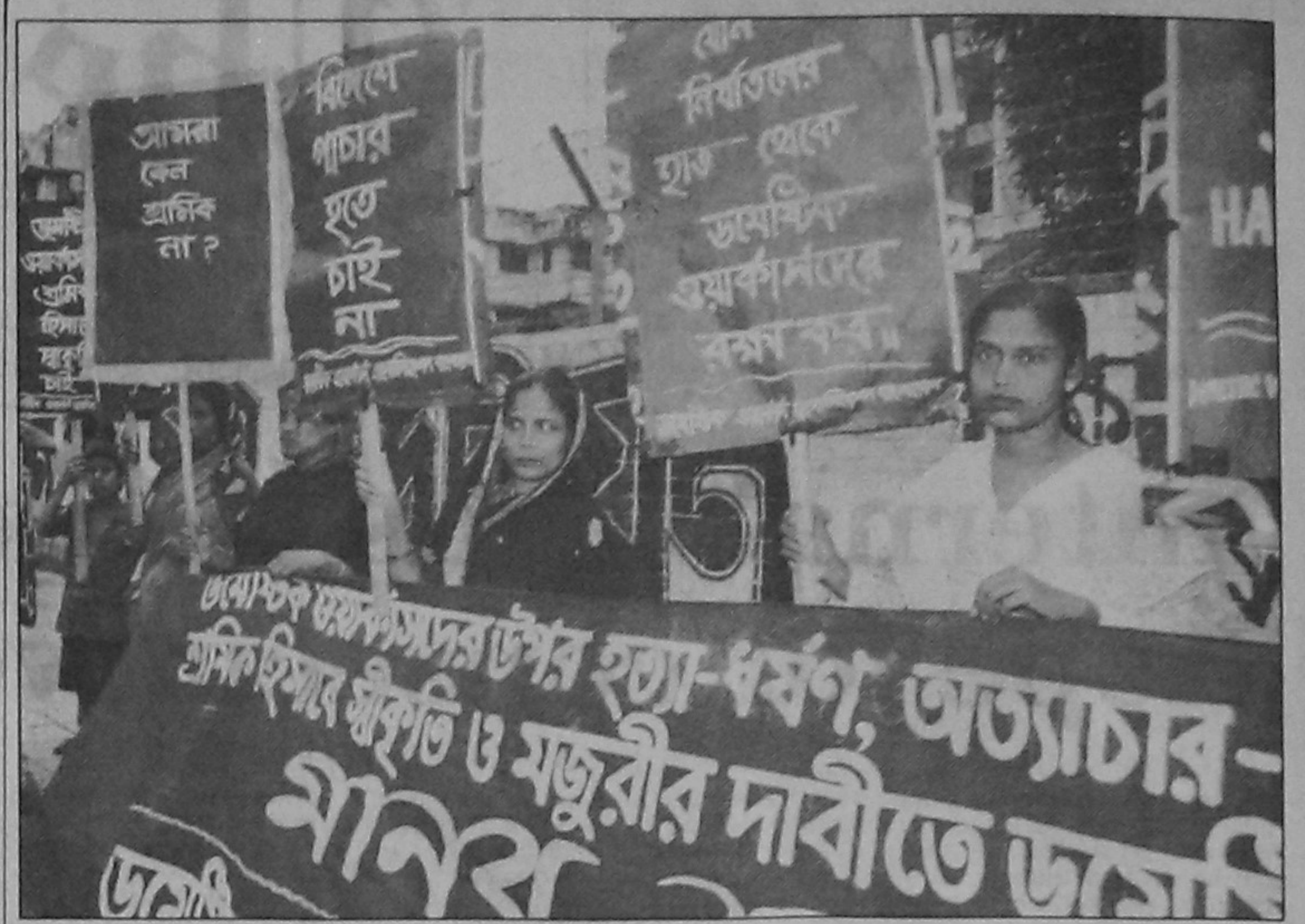
Domestic Workers of Bangladesh formed a human chain near the Secretariat at city's Tophkhana Road yesterday. They were protesting violence on and exploitation of domestic servants in the country and demanding minimum wage for their labour.

Shafiq was rushed to Dhaka Medical College Hospital at about 3:45 pm yesterday.