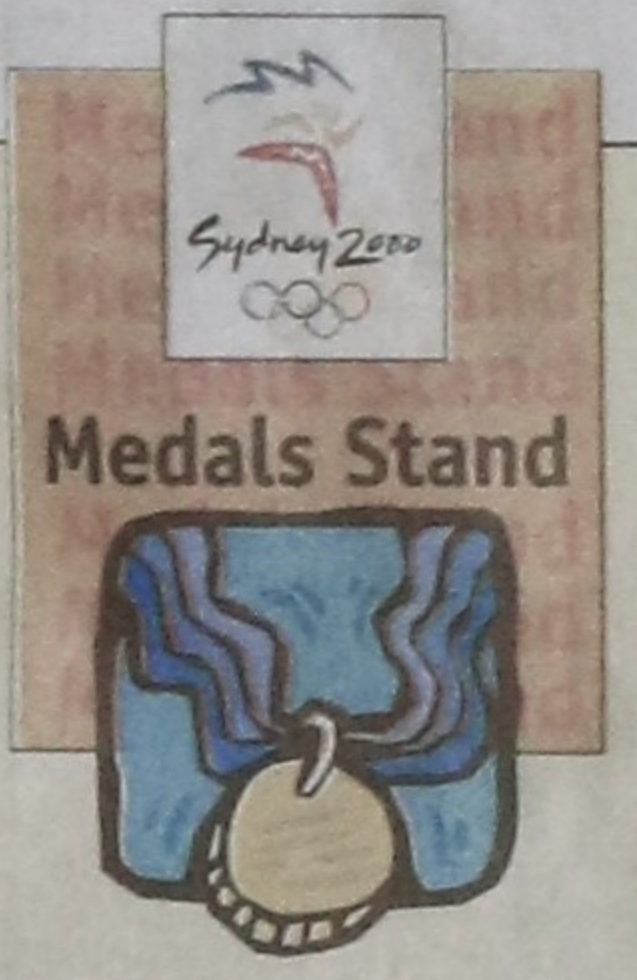
SYDNEY, Sept 19 (AFP) - Final updated Olympic medals table on the fourth day of the Sydney Games Tuesday.