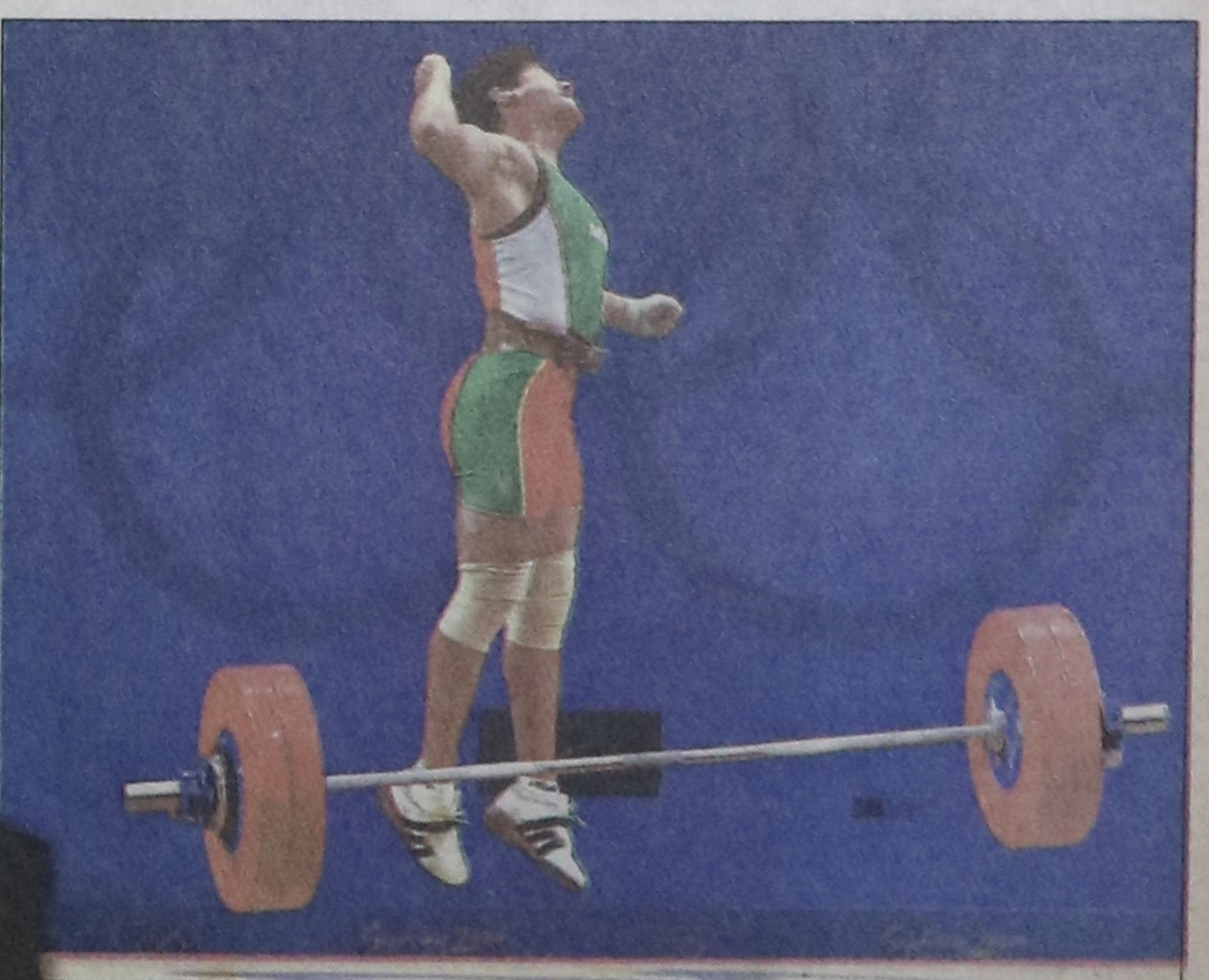
ON CLOUD NINE! Mexico's Soraya Jimenez jumps in ecstasy after her gold medal winning lift in the 58kg category of the weightlifting competition on September 18.