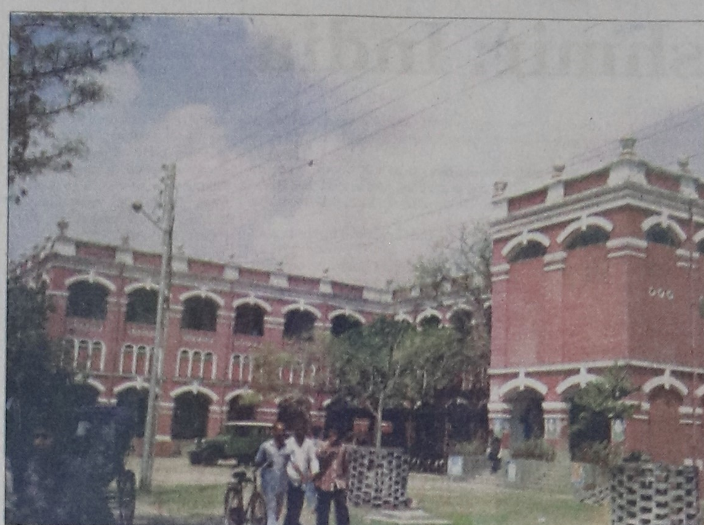
A partial view of the historic two-storied Jessore Collectorate building which is our national heritage.

Tillman Harkel, who served here as the trusted man of the Governor-General Warren Hastings, initiated the step to modernise the public administration department to suit the changing outlook of the natives, fully accommodating them with the dynamic change in British rule in Bengal. All the fruits of his endeavour was applied elsewhere in later days.