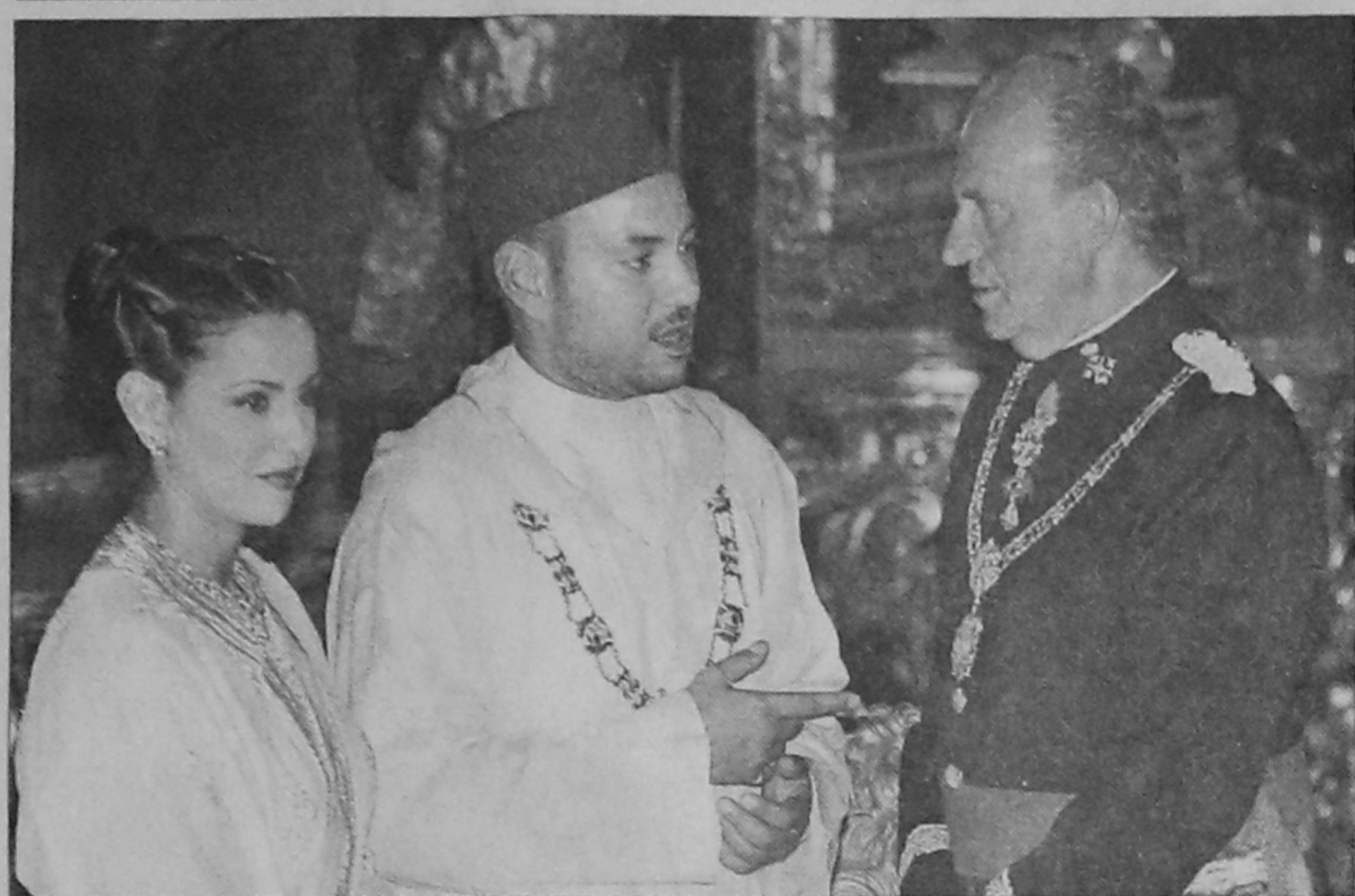
Spanish King Juan Carlos (R) talks with Moroccan King Mohammed VI (C) as his sister Lalla Meryem looks on at Orient Palace in Madrid at a gala dinner for the Moroccan monarch on his state visit to Spain on Monday.

The election date was given in the wake of President Alberto Fujimori's surprise announcement Saturday that the country would hold new elections, after his government was compromised by the release of a video showing a top presidential aide bribing an opposition lawmaker.