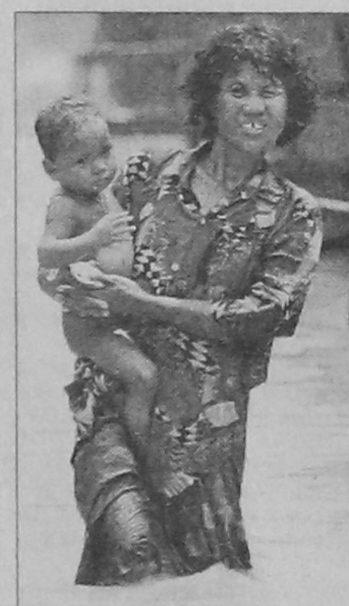
A Cambodian woman holding a child walks through a flooded area in Phnom Penh yesterday.