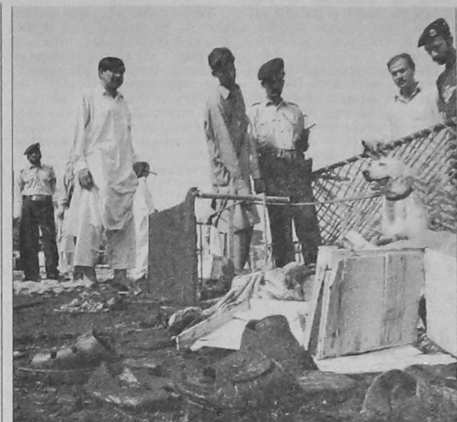
Security officials examine the fruit market bomb blast site scattered with blood-soaked shoes in the capital Islamabad yesterday.

But Walker said less rainfall in Laos and northern Cambodia would not translate into flood relief further downstream.