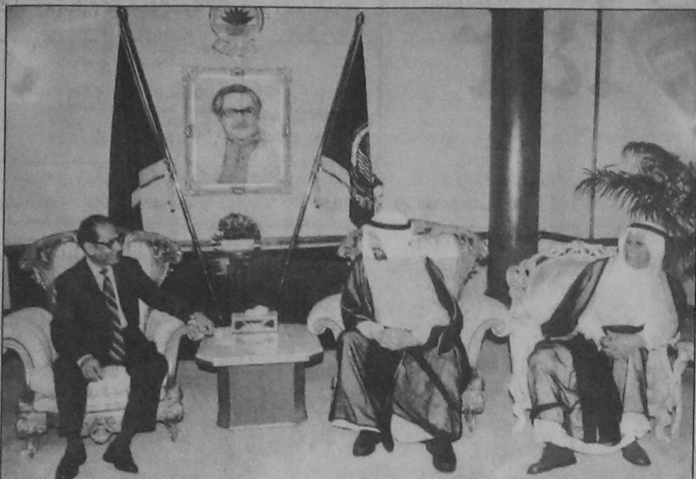
Abdul Wahab Al-Wazzan, special envoy of the Crown Prince and Prime Minister of Kuwait, called on President Shahabuddin Ahmed at Bangabhaban yesterday.