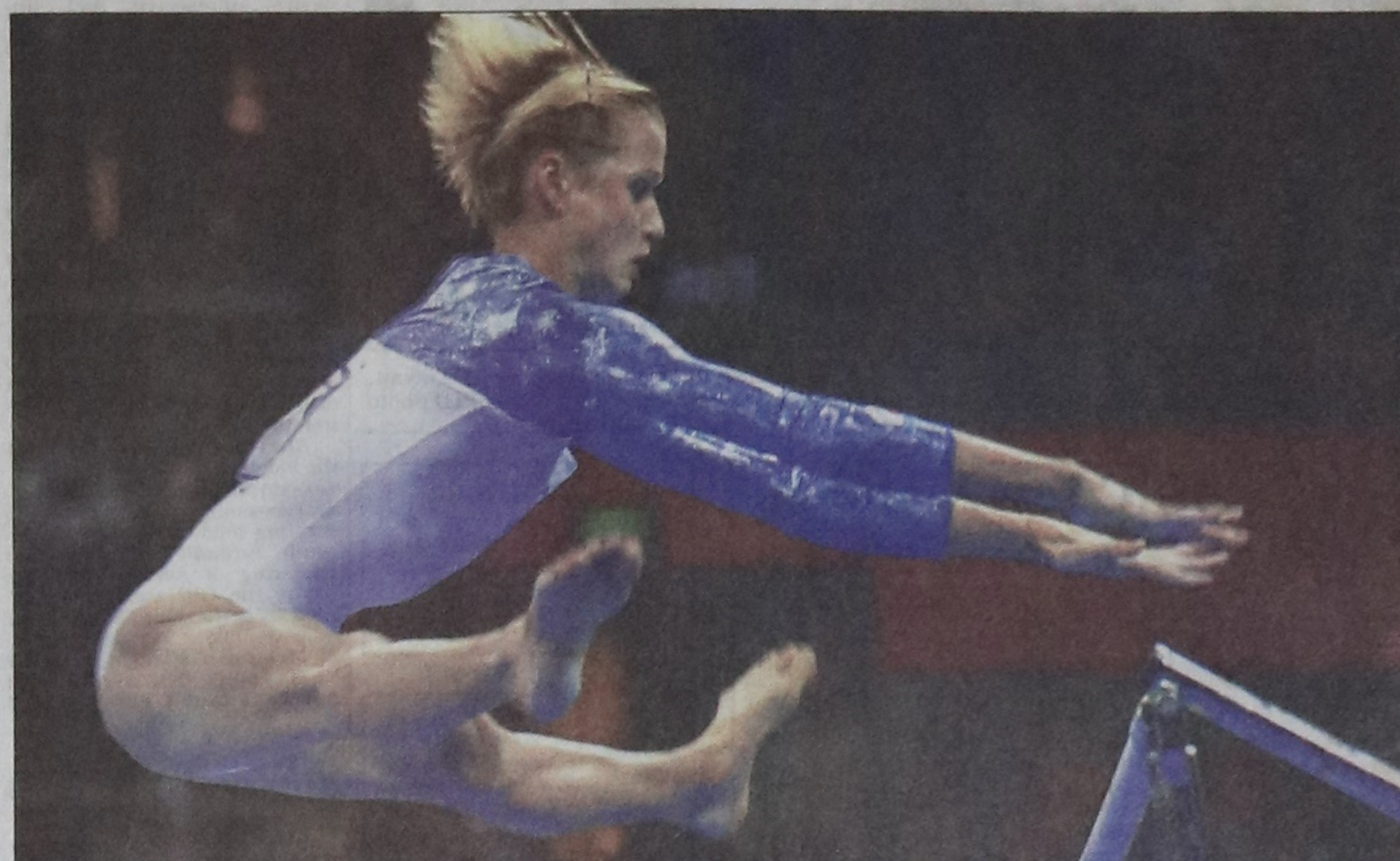
Svetlana Khorkina of Russia falls off the uneven bars yesterday at the SuperDome, during the gymnastics women's team finals at the Sydney 2000 Olympic Games. The 21-year-old gymnast is the reigning World, Olympic and European champion on the uneven bars.