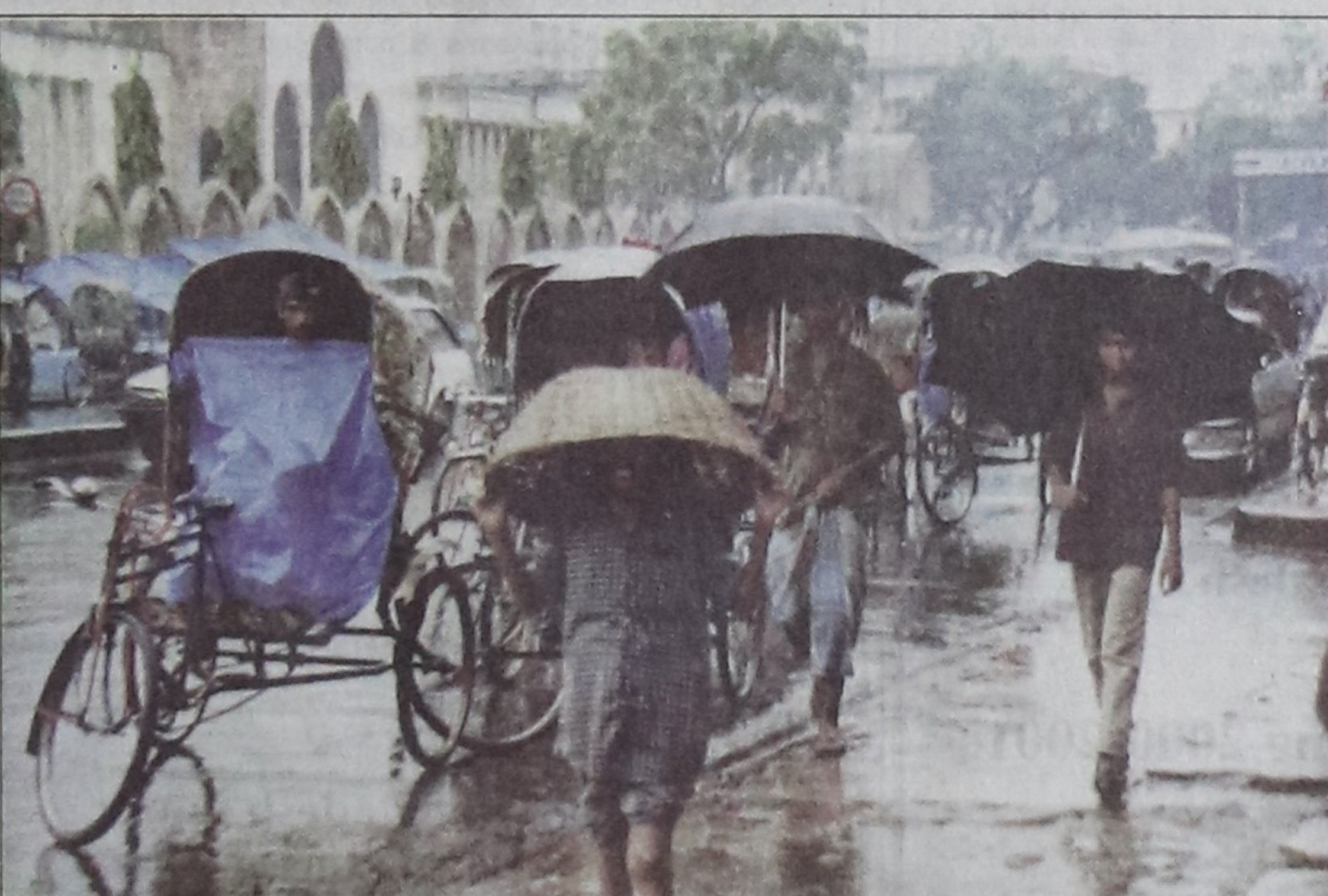
Incessant rain for the better part of the day yesterday put brakes on city life.