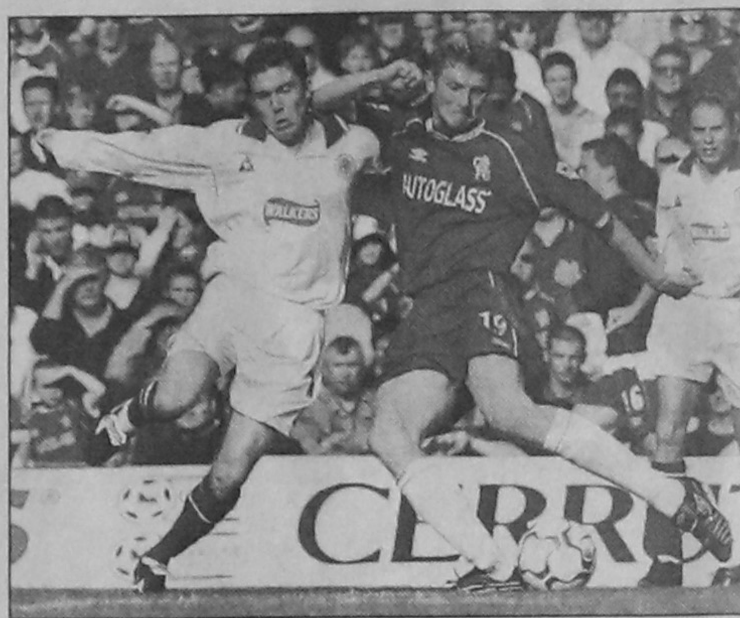
Chelsea's Norwegian striker Tore Andre Flo (R) fights for the ball with Phil Gilchrist of Leicester City during their Premiership clash at Stamford Bridge in London on September 17.

Gerard Houllier's men got off to the best possible start. Danny Murphy swung an early centre beyond the West Ham defence and Gerrard arrived at the back-post to score with a right foot shot in the 12th minute.