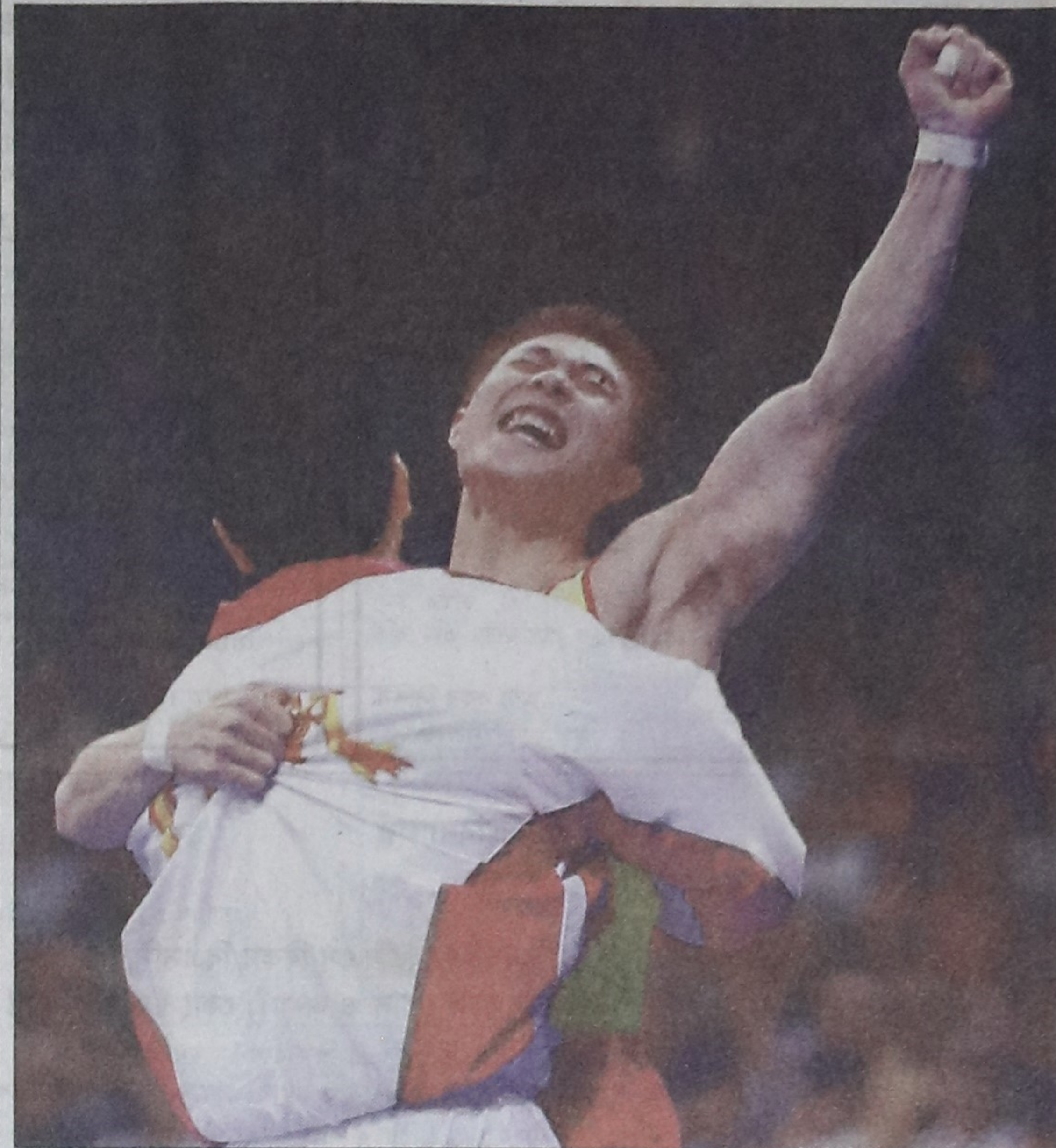
An ecstatic Li Xiaopeng of China is congratulated by a teammate at the SuperDome after the men's gymnastics team finals at the Sydney 2000 Olympic Games. China won their first-ever gold medal in an Olympic team event yesterday.