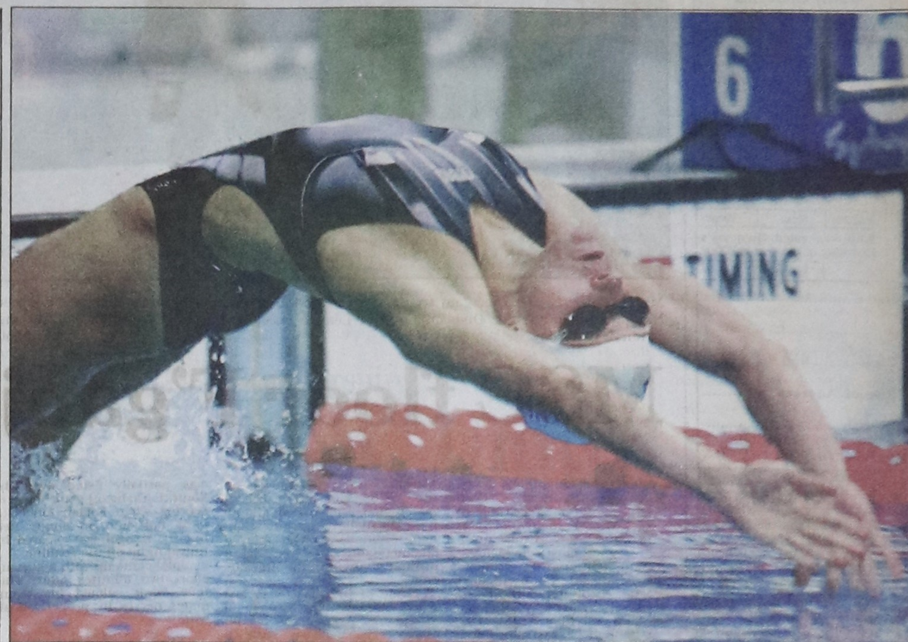
BACKSTROKING TO THE FINAL: Roxana Maracineanu of France during her 100-metre backstroke semifinal at the Sydney International Aquatic Centre yesterday. Maracineanu qualified for the final.

Note: Two bronze medals awarded in Judo.