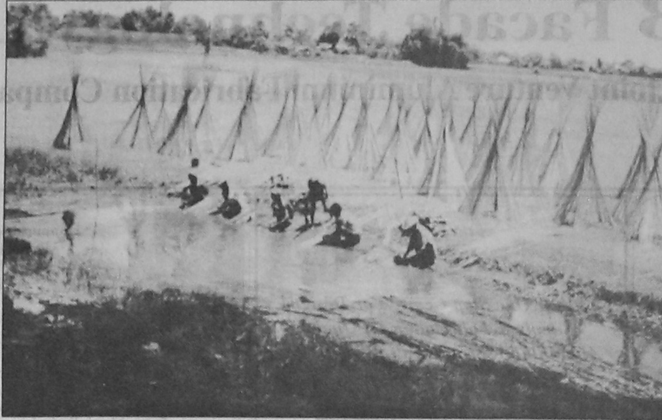
Farmers cultivate jute though they are deprived of its fair price every year. This is due to lack of pragmatic policy of the government. Photo shows: Jute processing going on in full swing somewhere in Kushtia district.

Magura, 10,985 hectares against 10,661 in Meherpur, 11,605 hectares against the target of 11,465 hectares in Chuadanga, 10,332 hectares against the target of 24,024 hectares in Jessore, 3,920 hectares against the target 13,325 hectares in Narail, 365 hectares against 1,424 hectares in Khulna, 331 hectare against 1,194 hectares in Bagerhat and 5,259 hectares against the target of 9,644 hectares in Satkhira.