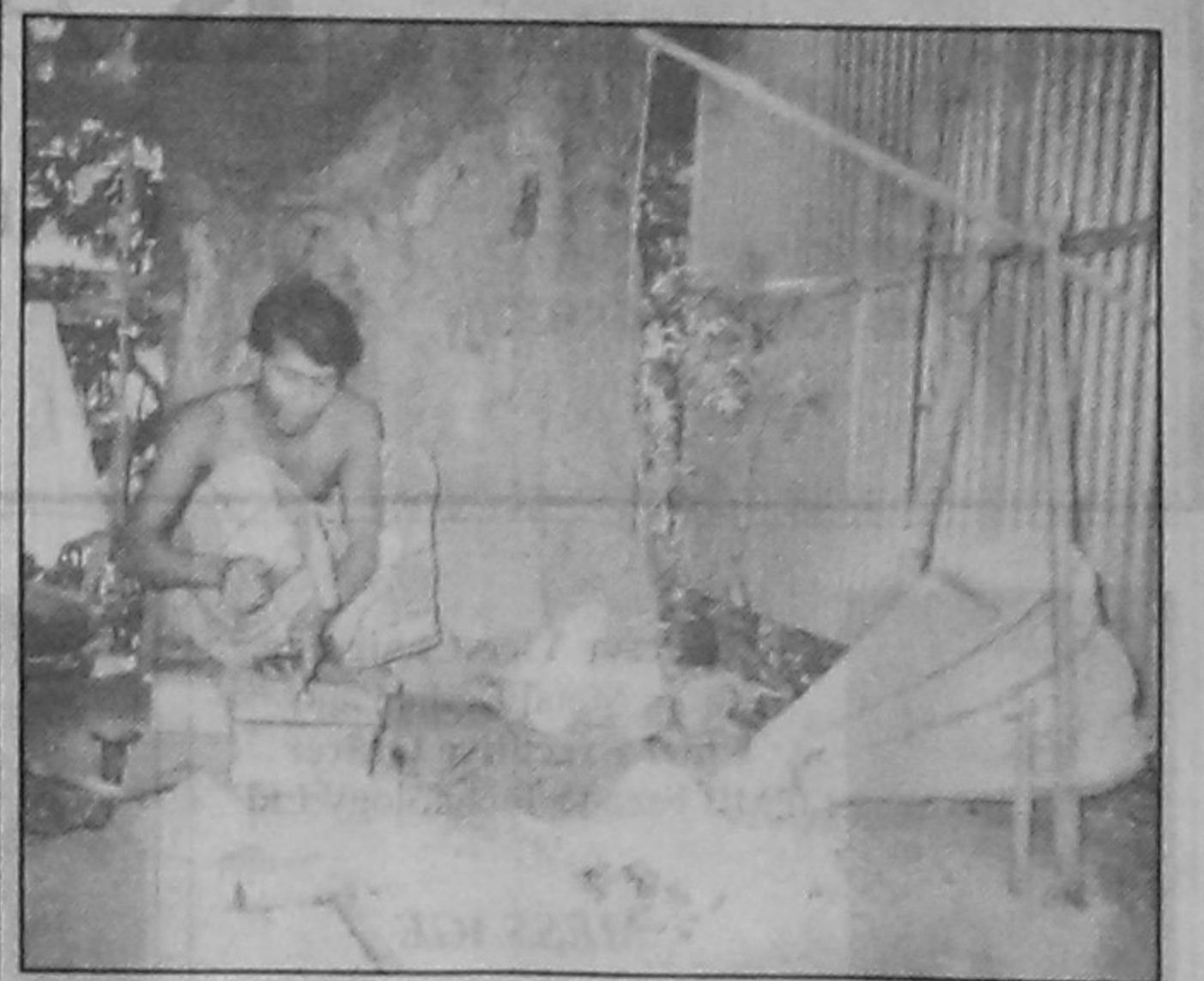
Blacksmiths of Magura district have been facing hard days now. This is due to poverty, shortage of capital and patronisation from the government and other non-governmental organisations.