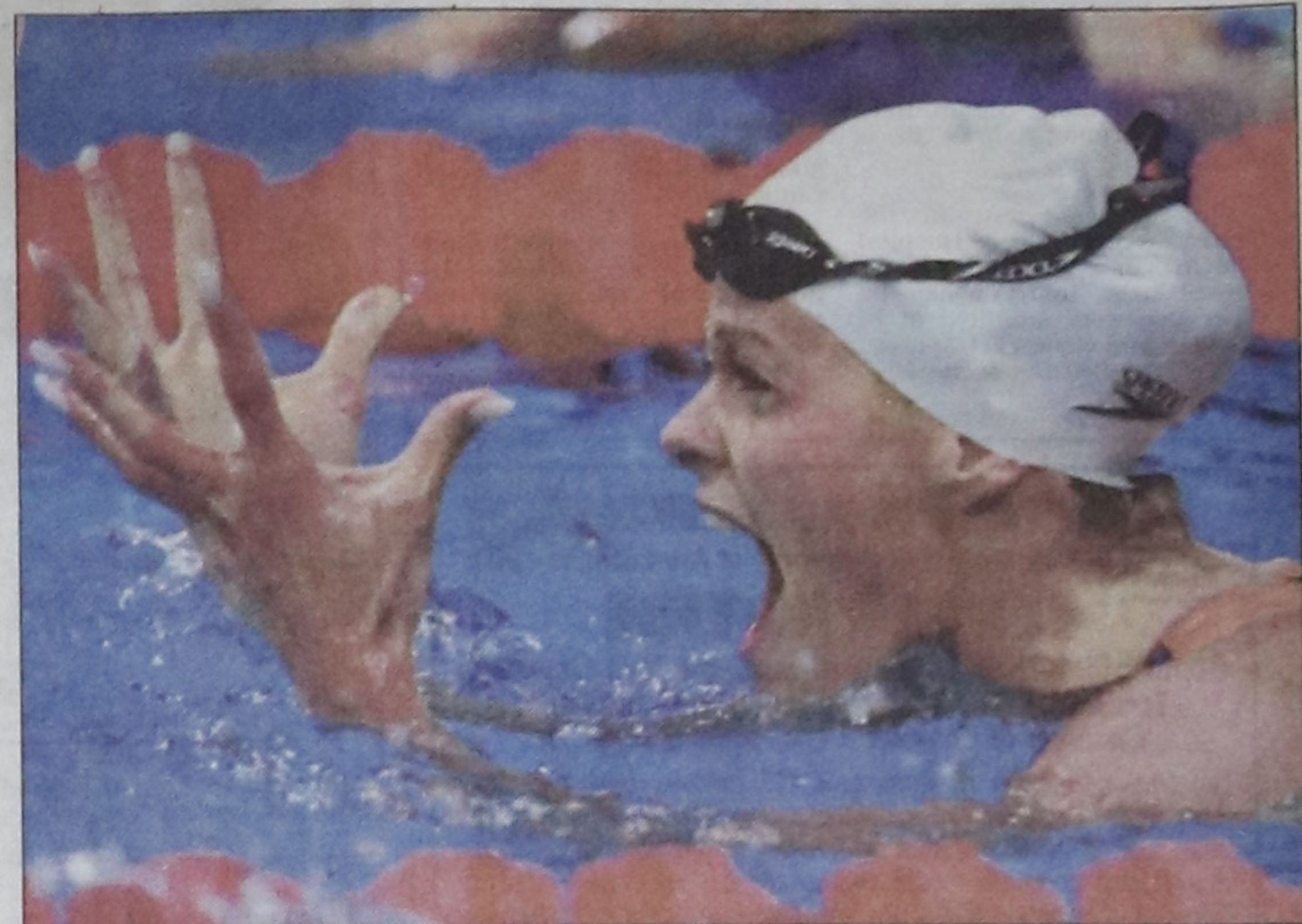
Dutch swimmer Inge de Bruijn jubilates after winning the gold medal and setting a new world record in 56.61 in her 100m butterfly final yesterday at Sydney International Aquatic Centre during the Sydney 2000 Olympic Games. Slovakian Martina Moravcova won silver medal and Dara Torres of US the bronze.

Petrobangla and its subsidiaries purchase 20 per cent of the total gas supplied from international oil companies under an international formula, making the purchase as costly as 1.4 dollar to 3 dollar per unit.