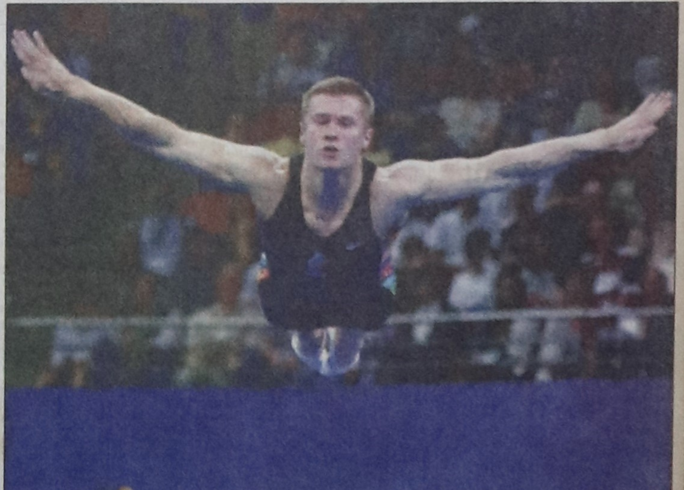
AIR ALEXEI! Russian reigning world champion gymnast Alexei Nemov soars in the air during his floor exercise routine at the Super Dome in Sydney yesterday.