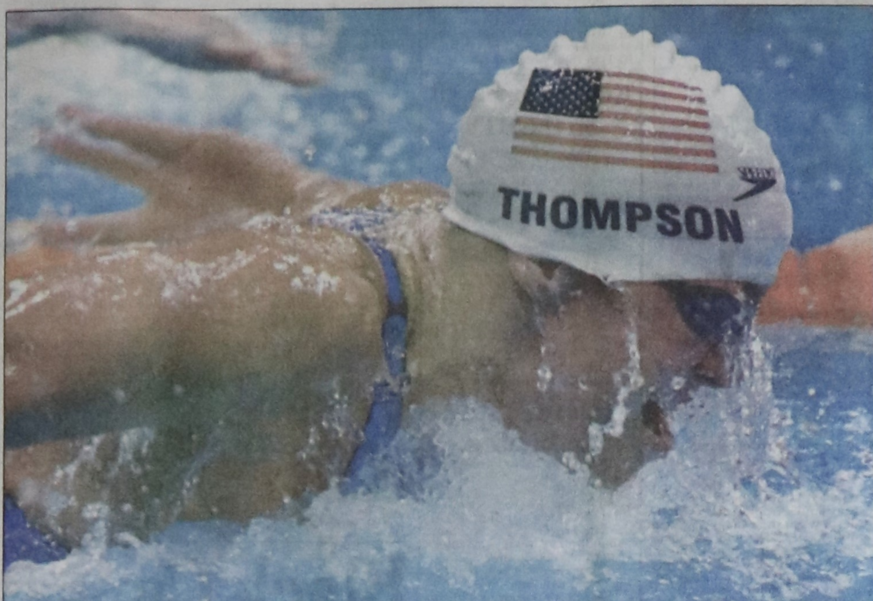
JENNY-OF-ALL-TRADES: Star US swimmer Jenny Thompson seen here during the heats of the ladies 100-metre butterfly at the Sydney International Aquatic Centre yesterday. Thompson later won her sixth Olympic gold with the American 4x100 metres relay team.