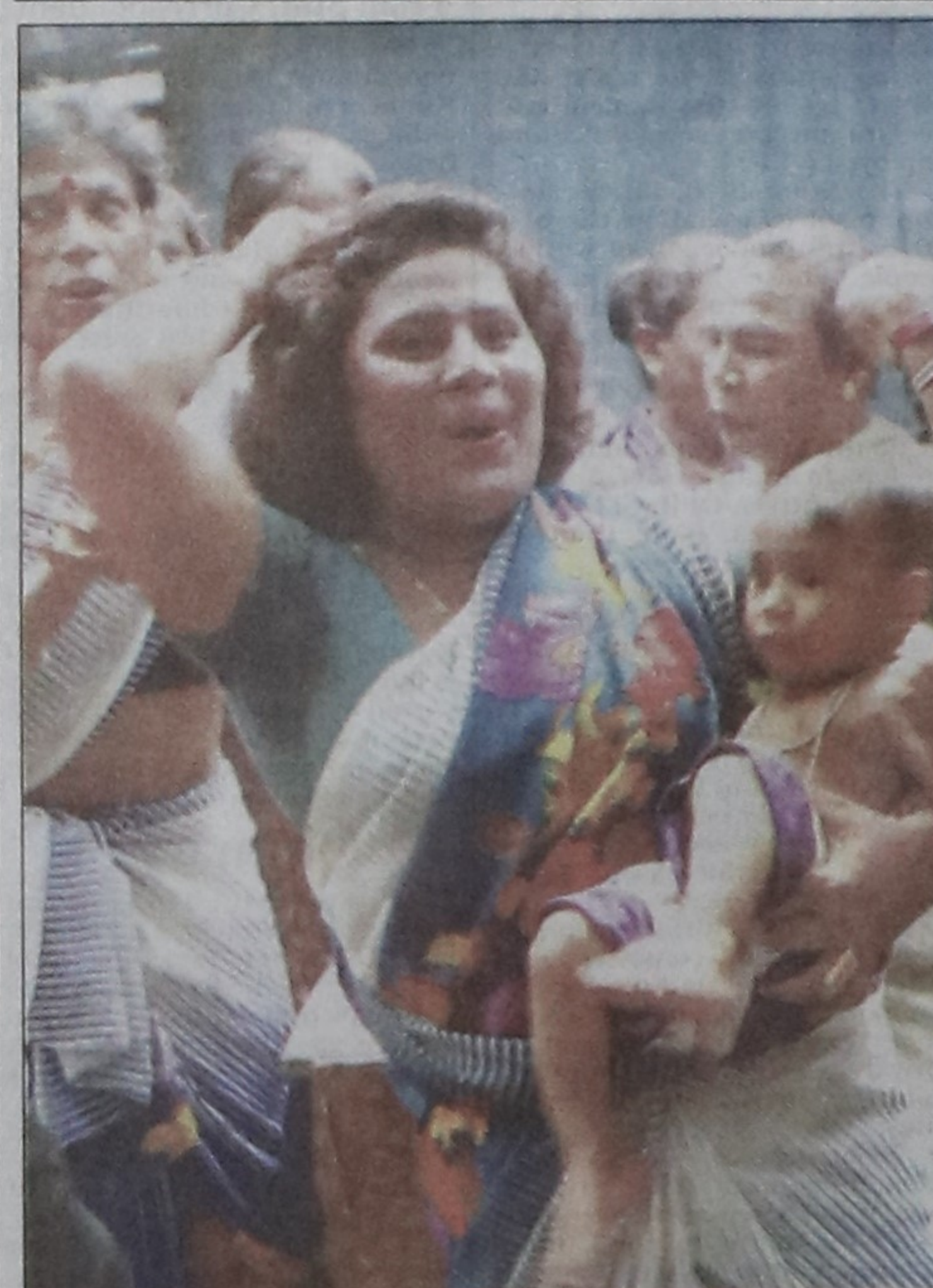
Some rights at last! Hermaphrodites (Hijras) celebrate with traditional dances at the end of their first ever national conference held yesterday in Dhamrai. The long neglected section of the society was given franchise this year.

About 50 people were injured in series of clashes yesterday. Police lobbed three tear gas shells to bring the situation under control. Of the injured, a restaurant owner was sent to the CMH, Dhaka last night in a critical with head injuries while some others were admitted to the Sylhet MAG Osmani Medical College Hospital and private clinics.