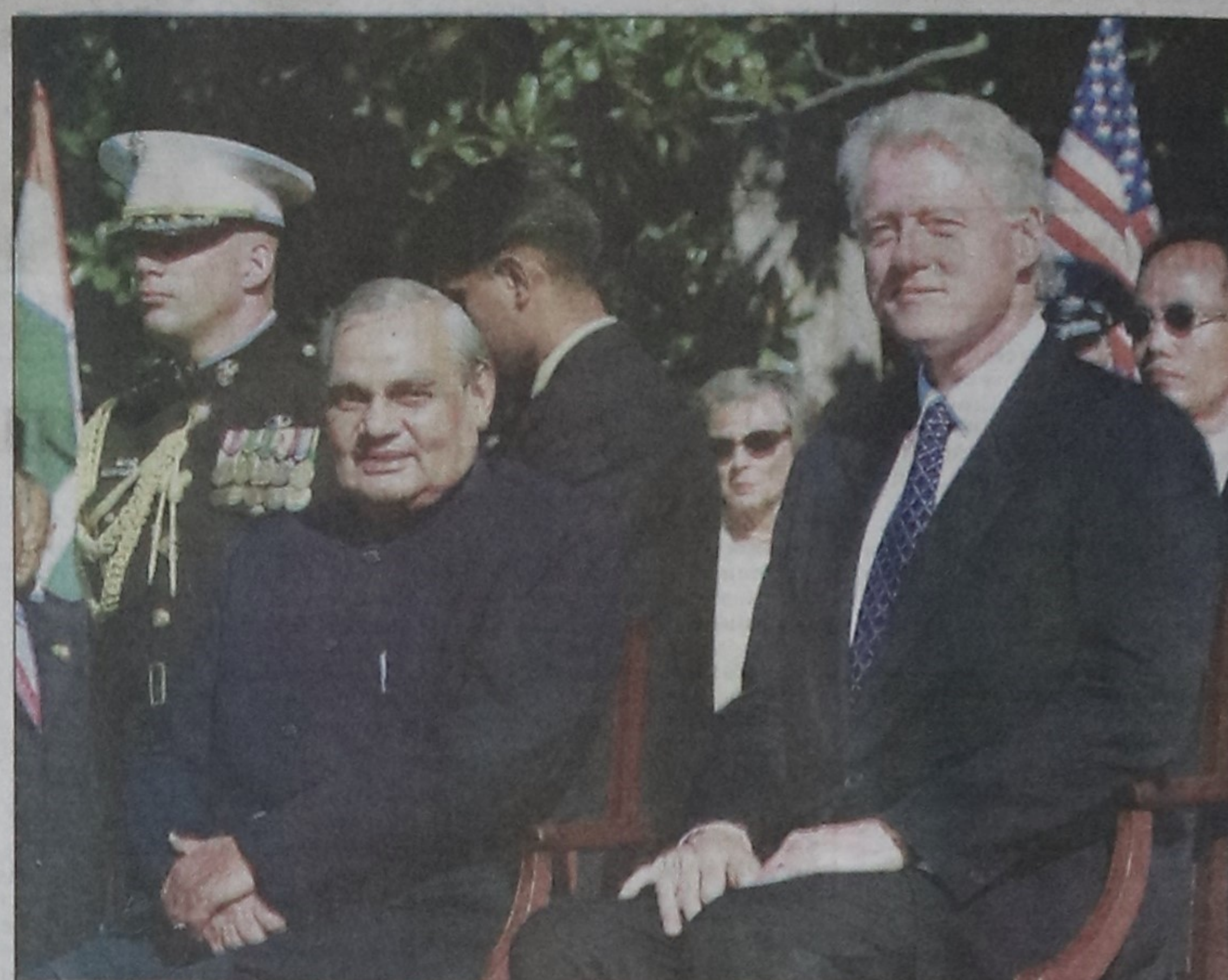
US President Bill Clinton (R) and Indian Prime Minister Atal Behari Vajpayee review US troops in Washington, DC on Friday. Vajpayee is on his first official visit to US.