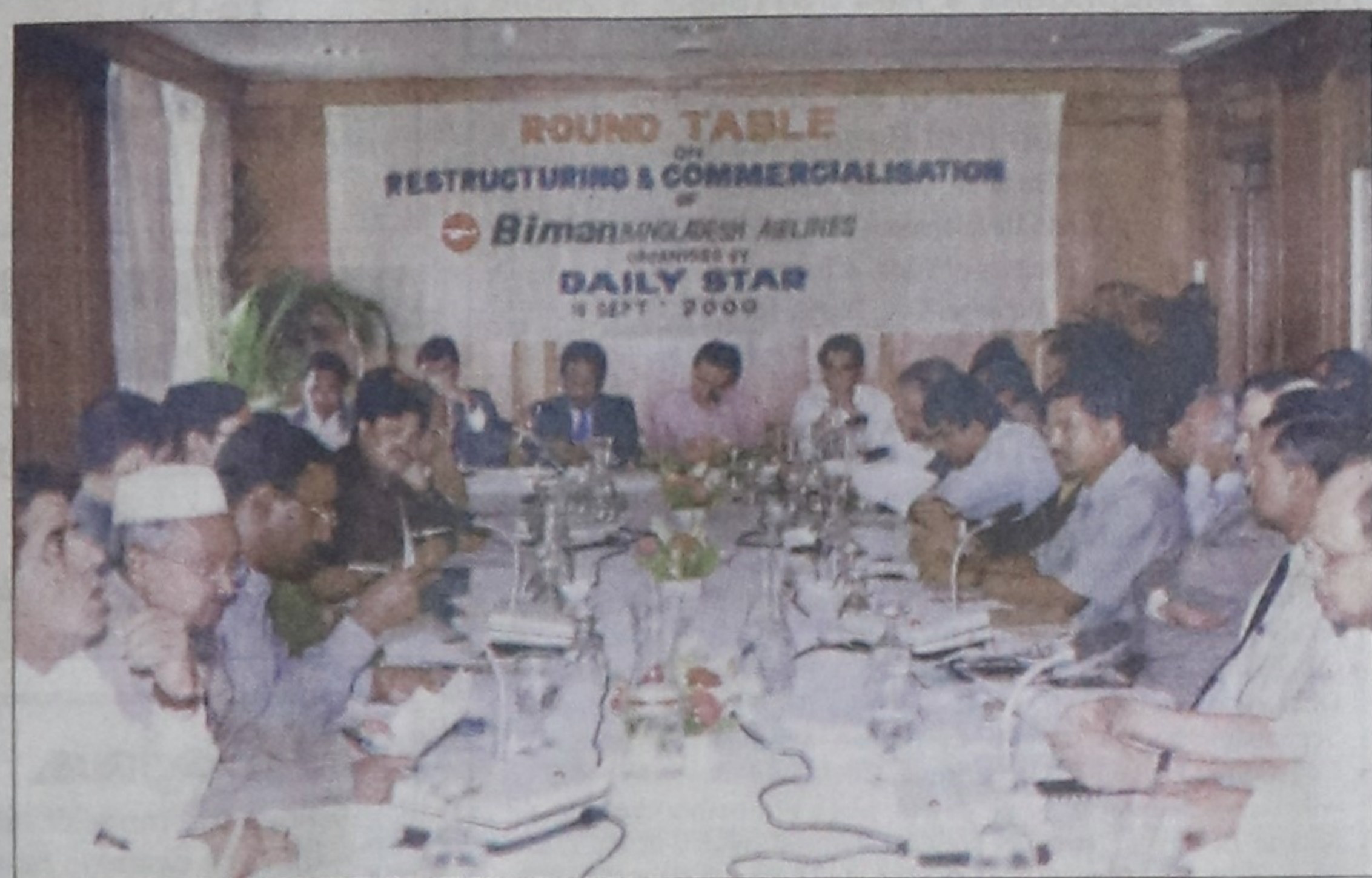
Participants in the day-long roundtable on Restructuring & Commercialisation of Biman organised by The Daily Star at a city hotel yesterday.