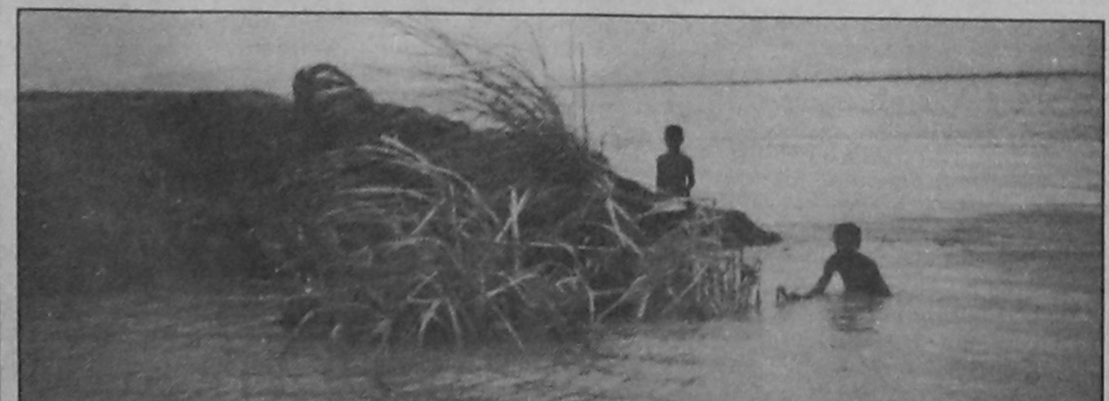
Jamuna has devoured the home of this family of three members recently at Makri in Shahjadpur upazila under Sirajganj district. Photo shows mother and her two sons are engaged in recovering their lost articles from the erosion site.

The main ingredient of wine and 65 blank saline bags from a remote jungle in the area. But there was no arrest. The haul was handed over to local Narcotics Control office. Two cases were filed.