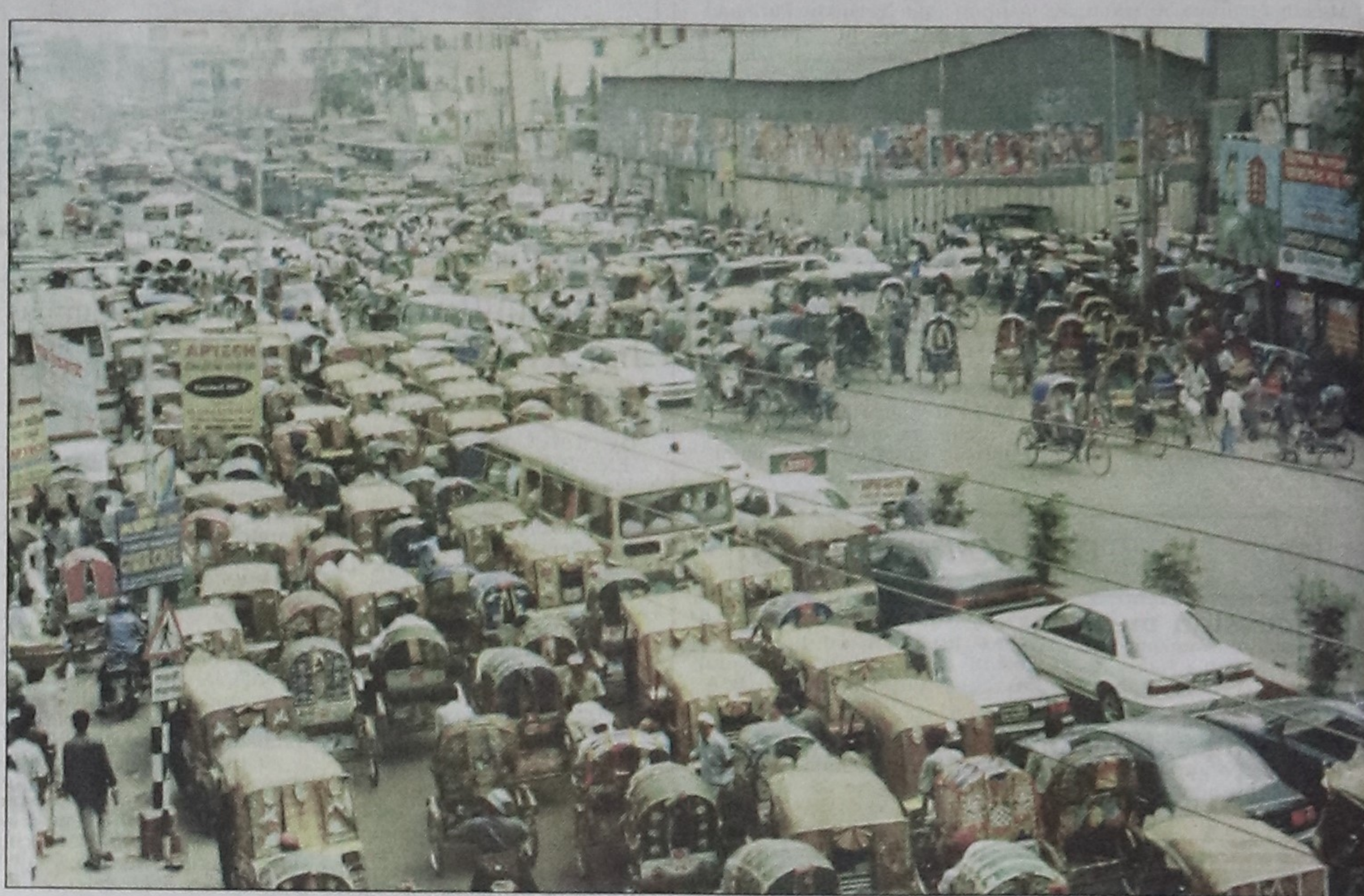
Road rage: Rush hour traffic in desperate attempt to squeeze through every available space at Kakrail crossing in the city yesterday.