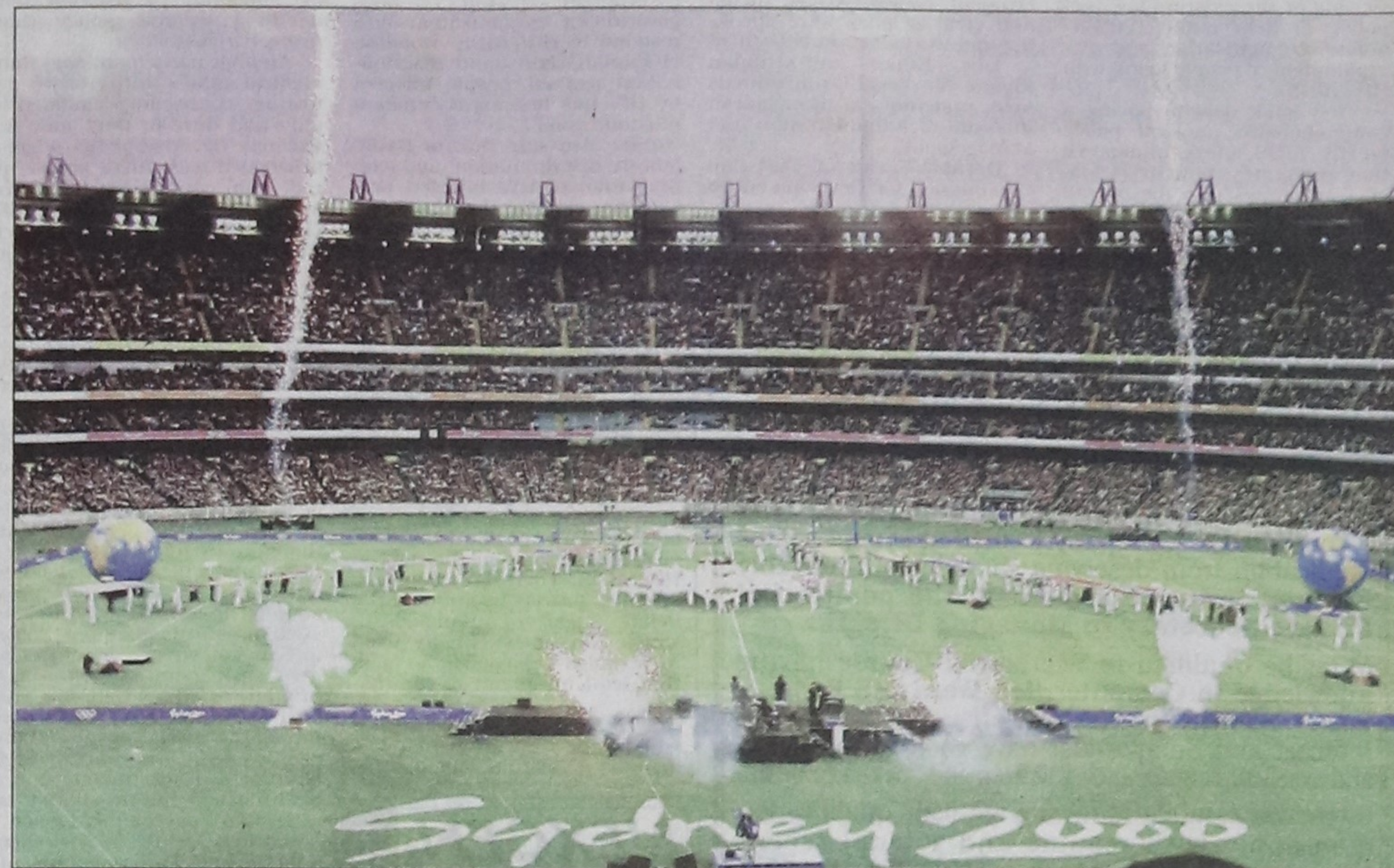
Fireworks during the opening ceremony for the Sydney 2000 Olympic football preliminaries in Melbourne yesterday. The Millennium Games will be held in Sydney from September 15 to October 1 with football preliminaries being held throughout Australia.