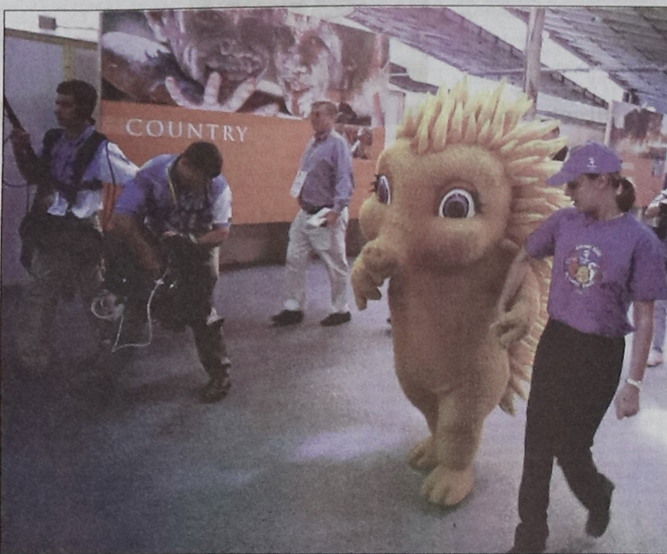
Millie, one of the mascots of the Sydney 2000 Olympic Games is shown at the Main Press Centre in Sydney yesterday, three days before the opening ceremony of the Games. Millie is an echidna, an egg-laying mammal, one of the rarest animals in the world.

Officials were eager to avoid See page 11 col 7