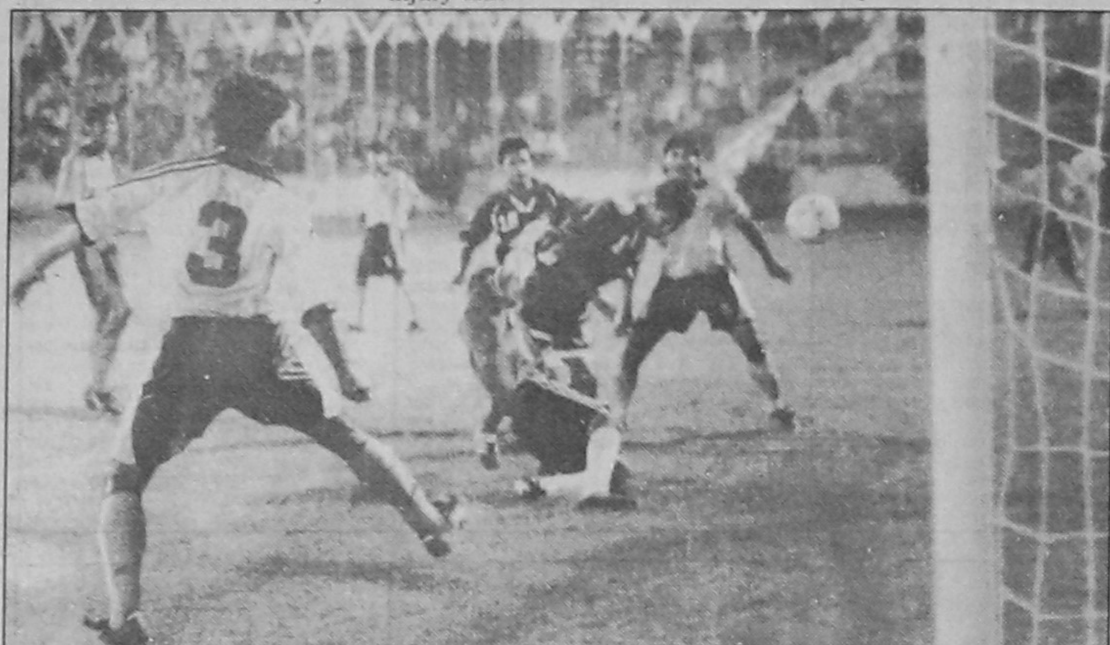
Action from yesterday's National Bank Premier Division football league match between Dhanmondi Club and Youngmen's Club. Fakirerpool at the Bangabandhu National Stadium.

It was Dhanmondi's first win after two consecutive defeats. On the other hand Victoria conceded their third defeat to remain at the bottom of the table with no points.