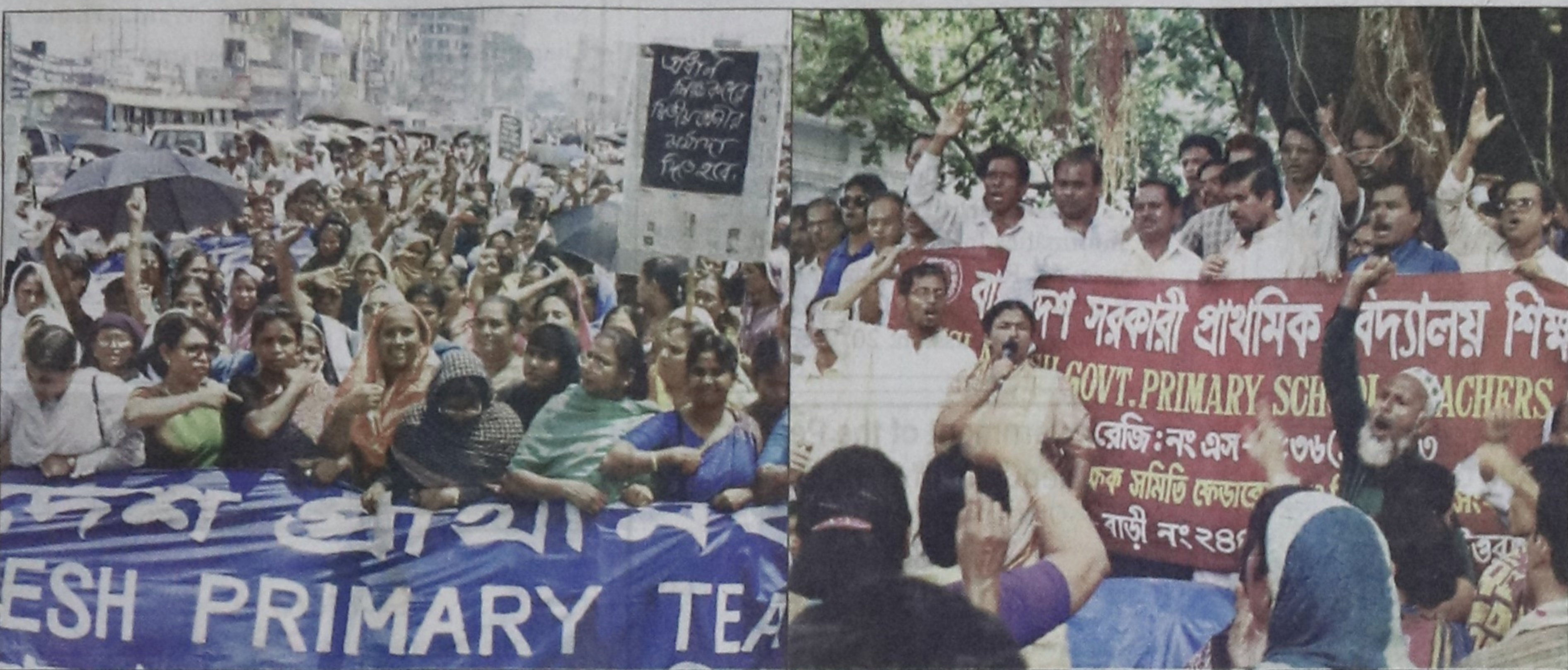
Teachers in the streets: Bangladesh Primary (School) Teachers' Association (left) took out a procession in the city and Bangladesh Government Primary School Teachers' Association held a rally in front of the High Court yesterday in support of their one-point and 15-point demands, respectively.

VOL. X NO. 234 REGD. NO. DA 781 • www.dailystarnews.com • DHAKA WEDNESDAY, SEPTEMBER 13, 2000 • BHADRA 29, 1407 BS • JAMADIUS SAANI 13, 1421 HIJRI • 12 PAGES PRICE: TAKA 6.00