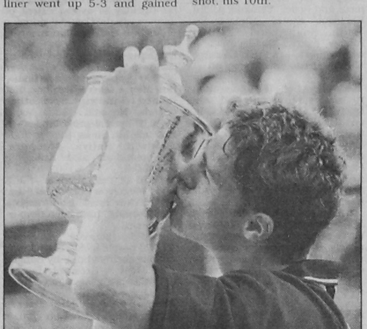
SWEETEST OF THEM ALL: 20-year-old Russian Marat Safin kisses the US Open trophy after beating American Pete Sampras in the men's singles final at the Flushing Meadows in New York on September 10.

The 6-foot-4 powerful baseliner went up 5-3 and gained