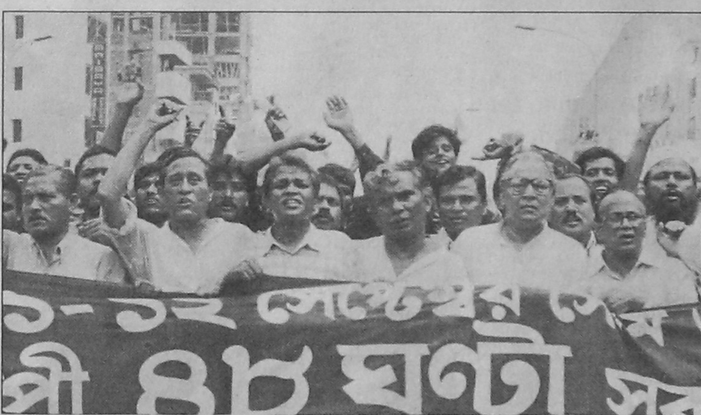
Leaders and activists of Srantik Karmachari Oikya Parishad (SKOP) took out a procession in the city yesterday. SKOP has called a 48-hour rail-road barricade programme beginning today demanding implementation of agreement signed with the government two years ago.