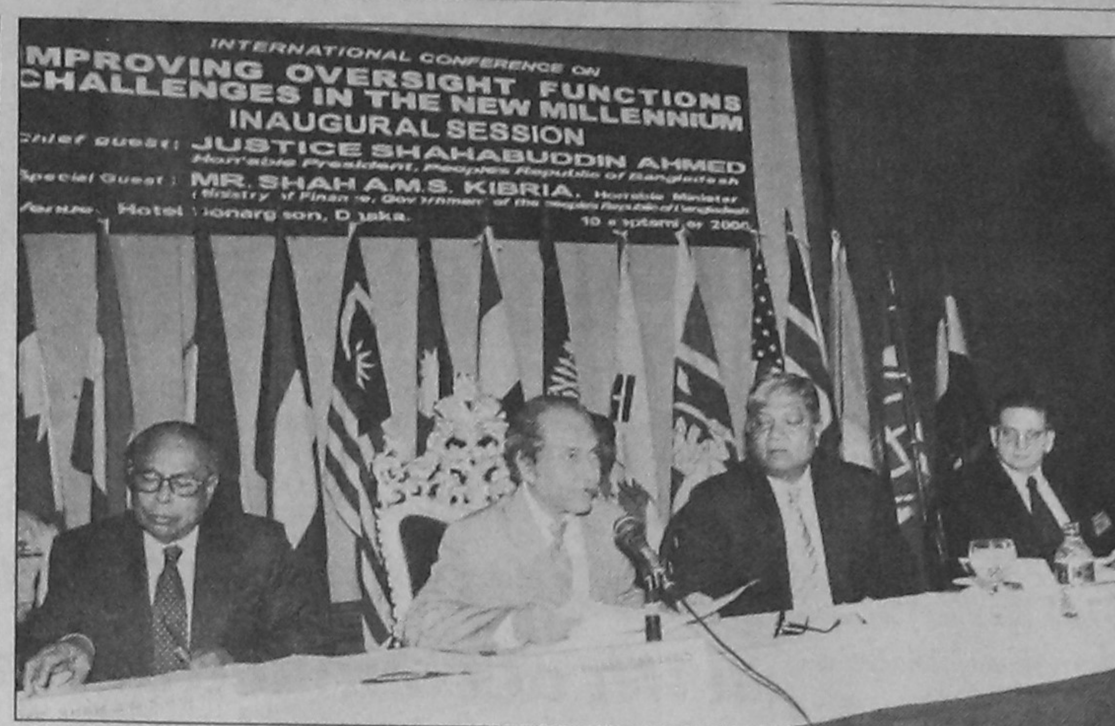
President Shahabuddin Ahmed addressing the three-day international conference on "Improving Oversight Function: Challenges in the New Millennium" in the city yesterday.

She was scheduled to fly for Saudi Arabia today to perform Umrah at the invitation of the King of Saudi Arabia.