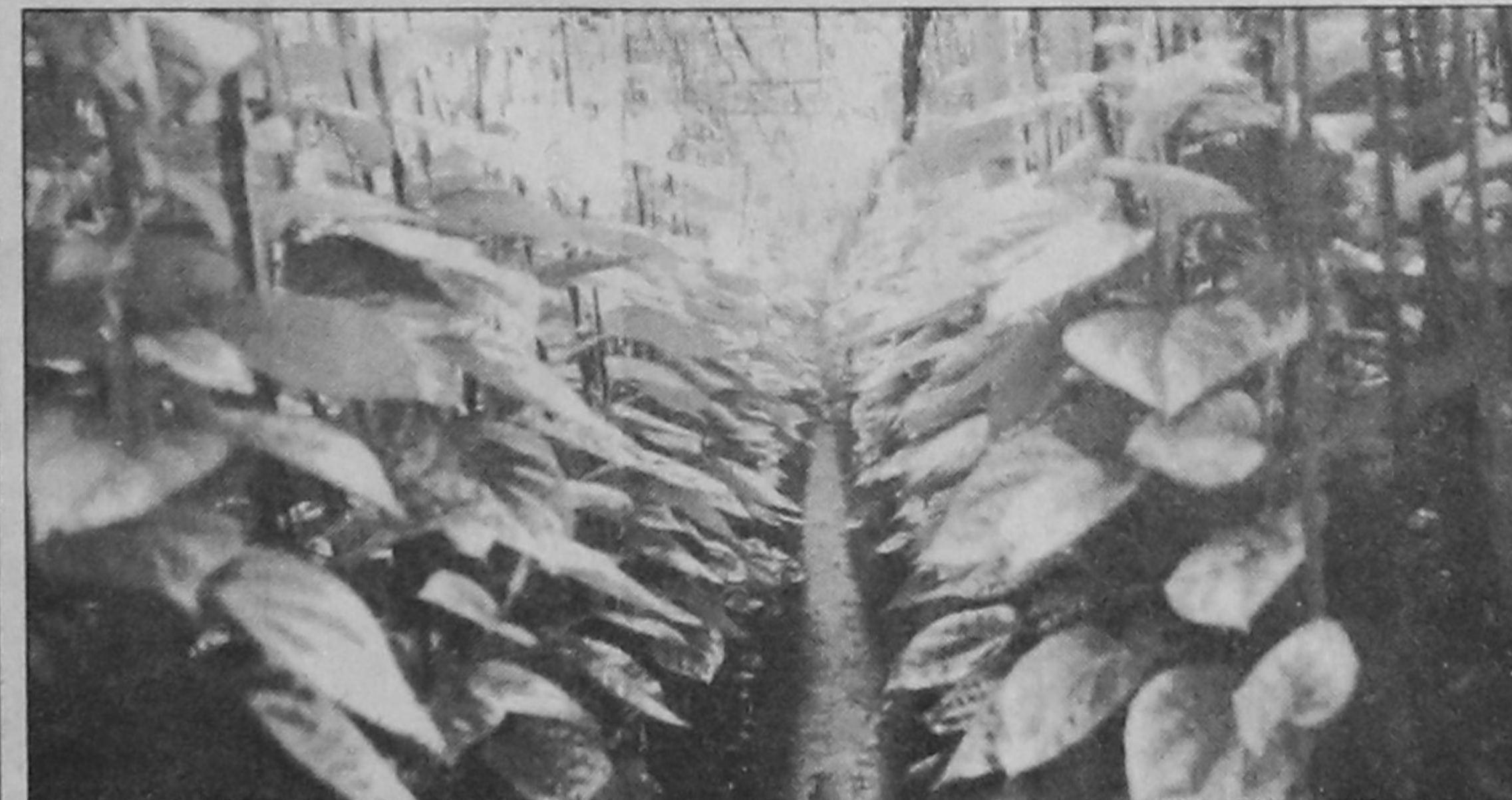
A betel leaf field at Mohanpur in Rajshahi, raised with the new chook chook organic fertiliser.

Trial production of the betel leaf was conducted as many as 78 upazilas in 18 districts using chook-chook-102 and farmers obtained positive results in each case. On the other hand trial production in potato field was carried out in Munshiganj and Bogra.