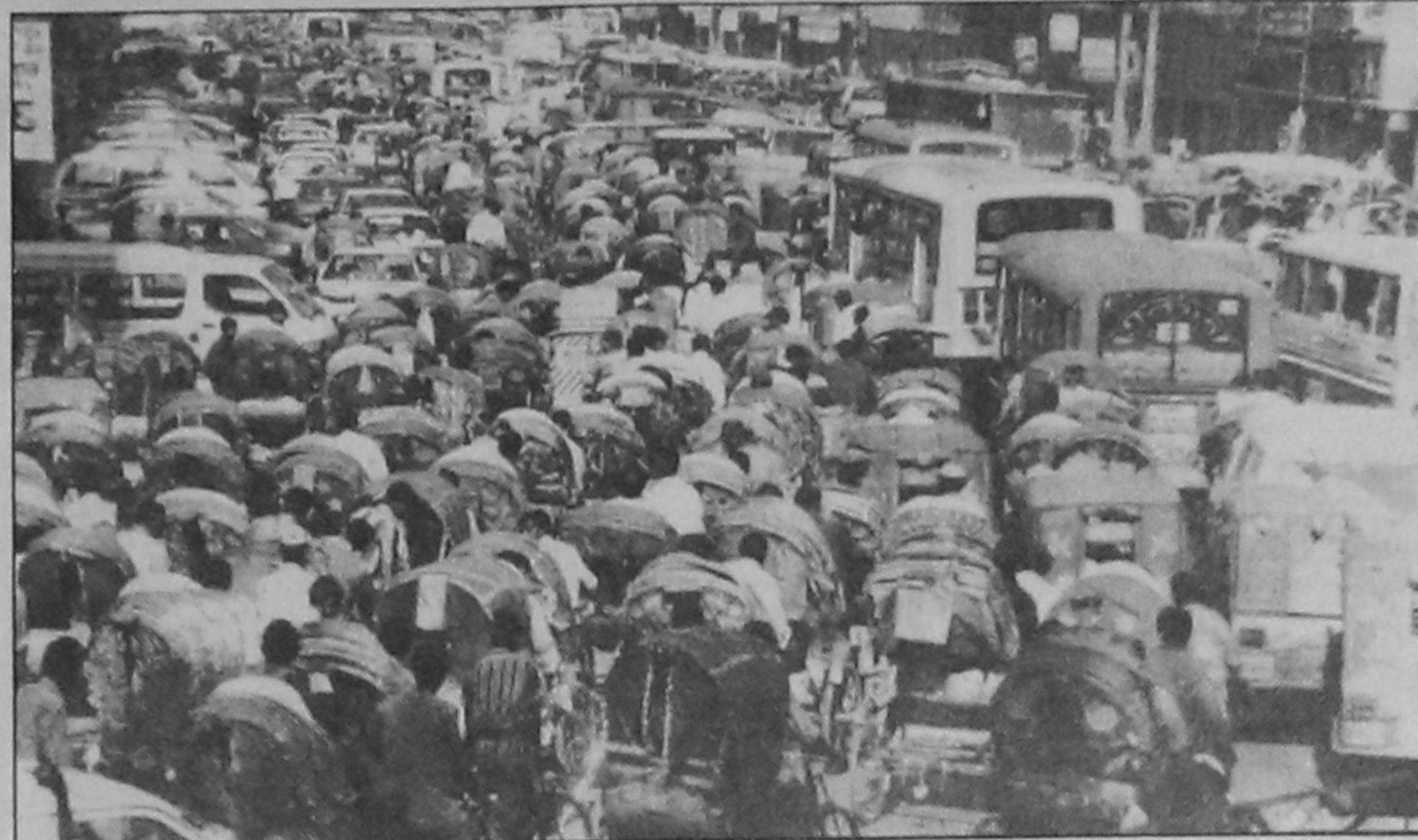
From bad to worse: The city's traffic congestion is one of the most alarming aspects of urban life. As the population of the city as well as the number of vehicles on the road keep on increasing everyday, the situation seems to be going from bad to worse. Picture shows city's Tophkana Road at noon yesterday, a scene not uncommon anymore.