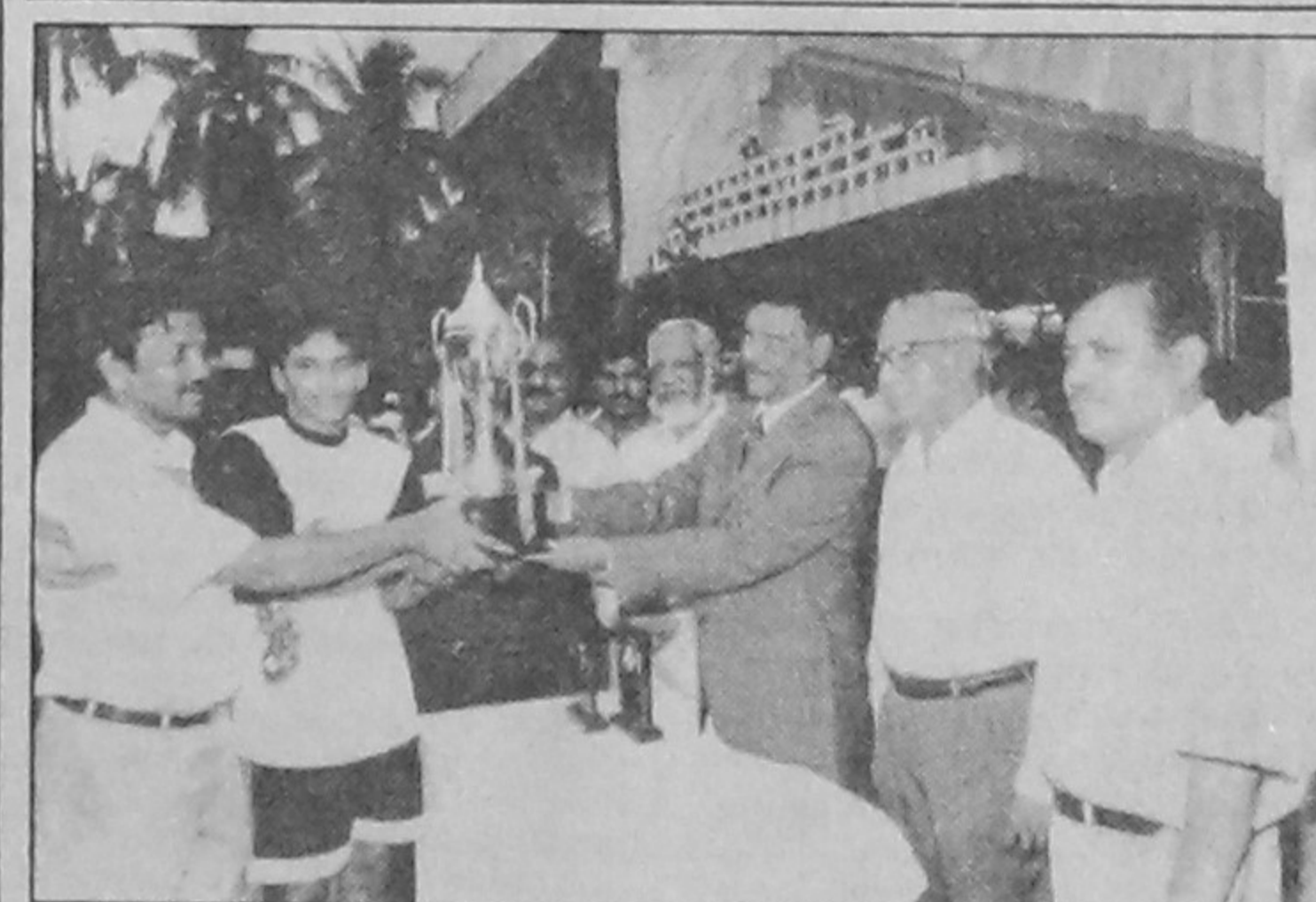
The captain and an official of Motijheel Model School and College receive the winners' trophy of the schools handball tournament from State Minister for Youth and Sports Obaidul Quader after the final yesterday.

State Minister for Youth and Sports Obaidul Quader later distributed prizes as the chief guest.