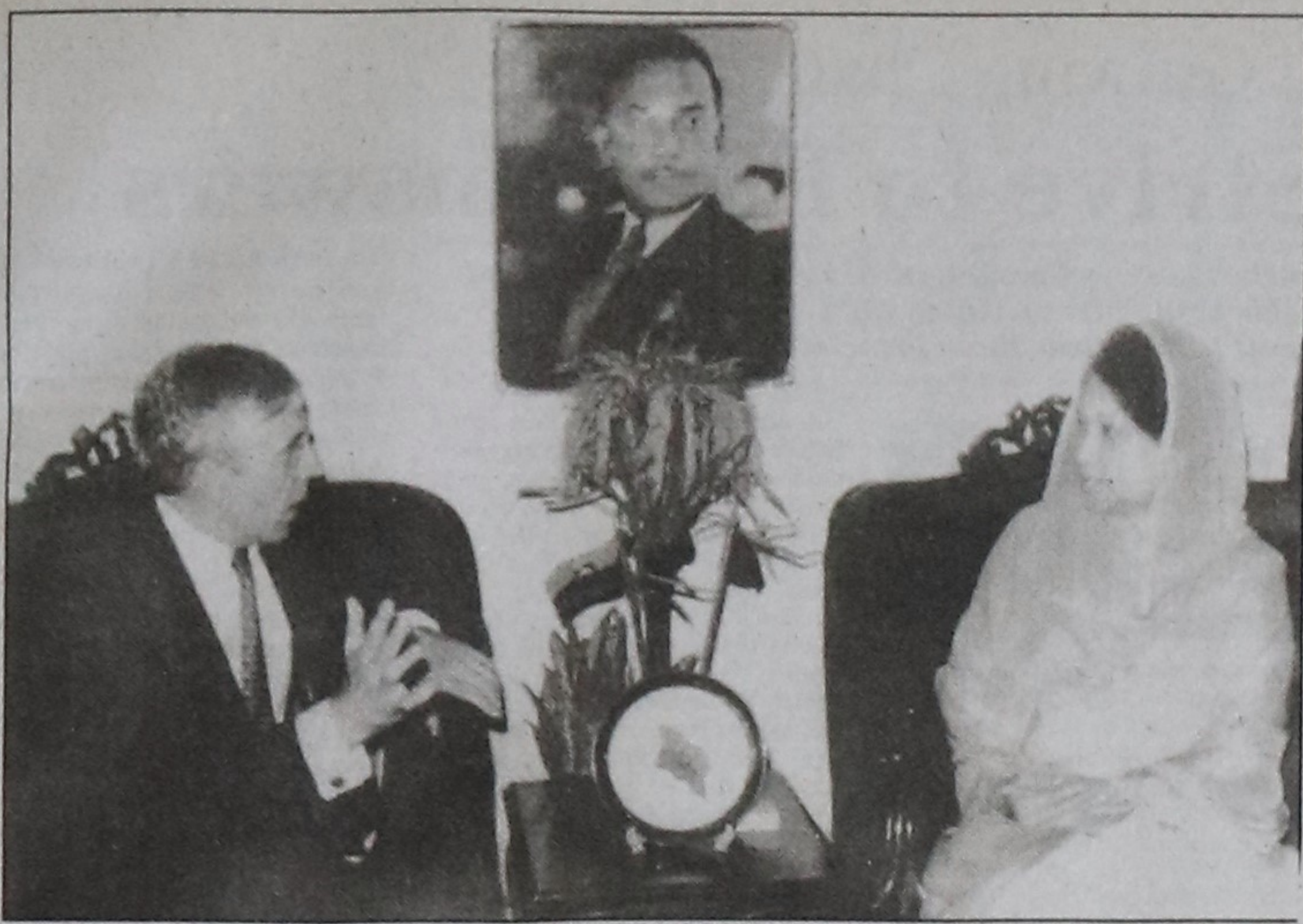
British Secretary of State for Home Affairs Jack Straw, PC MP, made a courtesy call on Leader of the Opposition in Parliament and BNP Chairperson Khaleda Zia at her 29, Minto Road official residence yesterday.