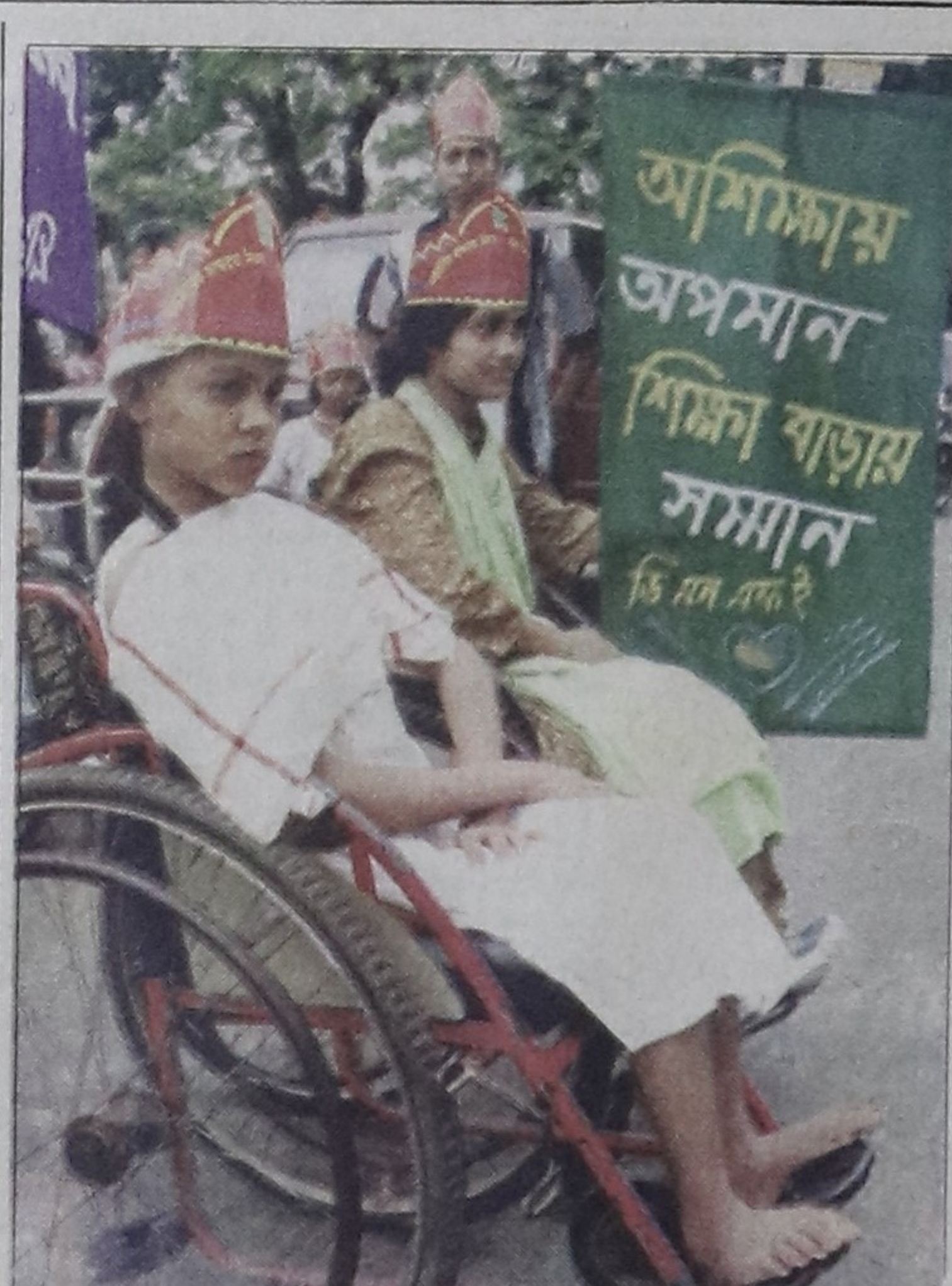
These two disabled girls were among many at a colourful rally in the city yesterday marking the International Literacy Day.

In fact, the number of people detained under different governments are as follows: Bangabandhu Sheikh Mujibur Rahman (74-75) - 3,336, Khondakar Moshitque Ahmed, Ziaur Rahman and Justice Abdus Sattar (75-81) - 8,242, HM Ershad (82-90) - 27,973, Khaleda Zia (91-95) and Sheikh Hasina (96-98) - 11,733.