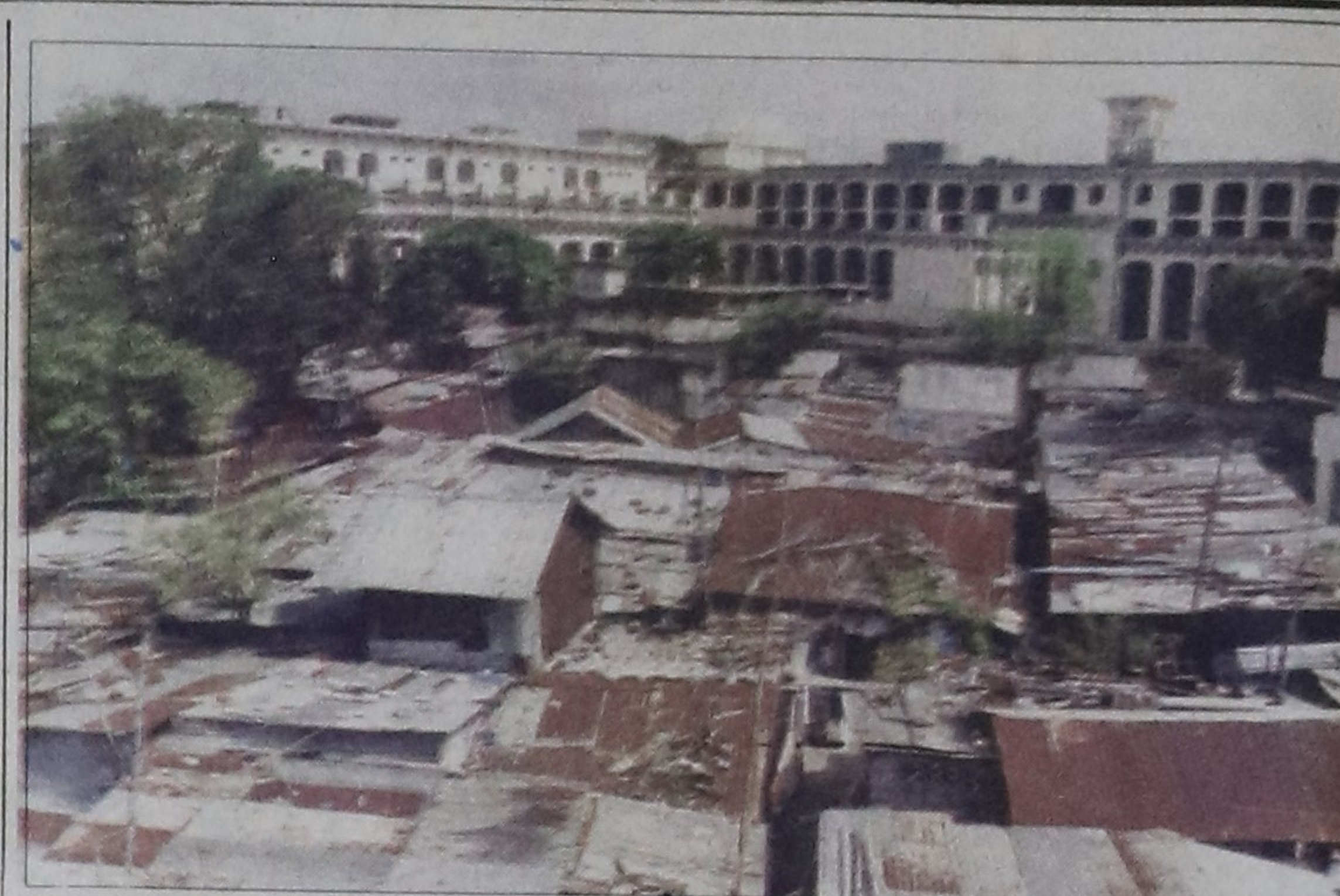
More than 300 shanties have sprung up on the 1.5 acres of land behind the OT Complex of Dhaka Medical College Hospital, which was allocated for construction of a Burn Unit.

Of the arrested, Mujib and Swapan are mill workers while the rest are outsiders and supporters of former CBA leader Rehanuddin Rehan.