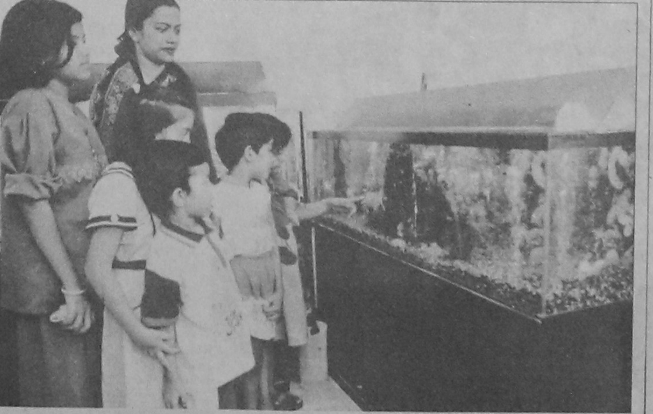
Visitors at the aquarium exhibition being held at Rina auditorium at 22/2 Sonargaon Road in the city. The exhibition ends tomorrow.

The New York Times in its Friday issue also prominently featured the prime minister's speech made on Thursday at the Security Council meeting.