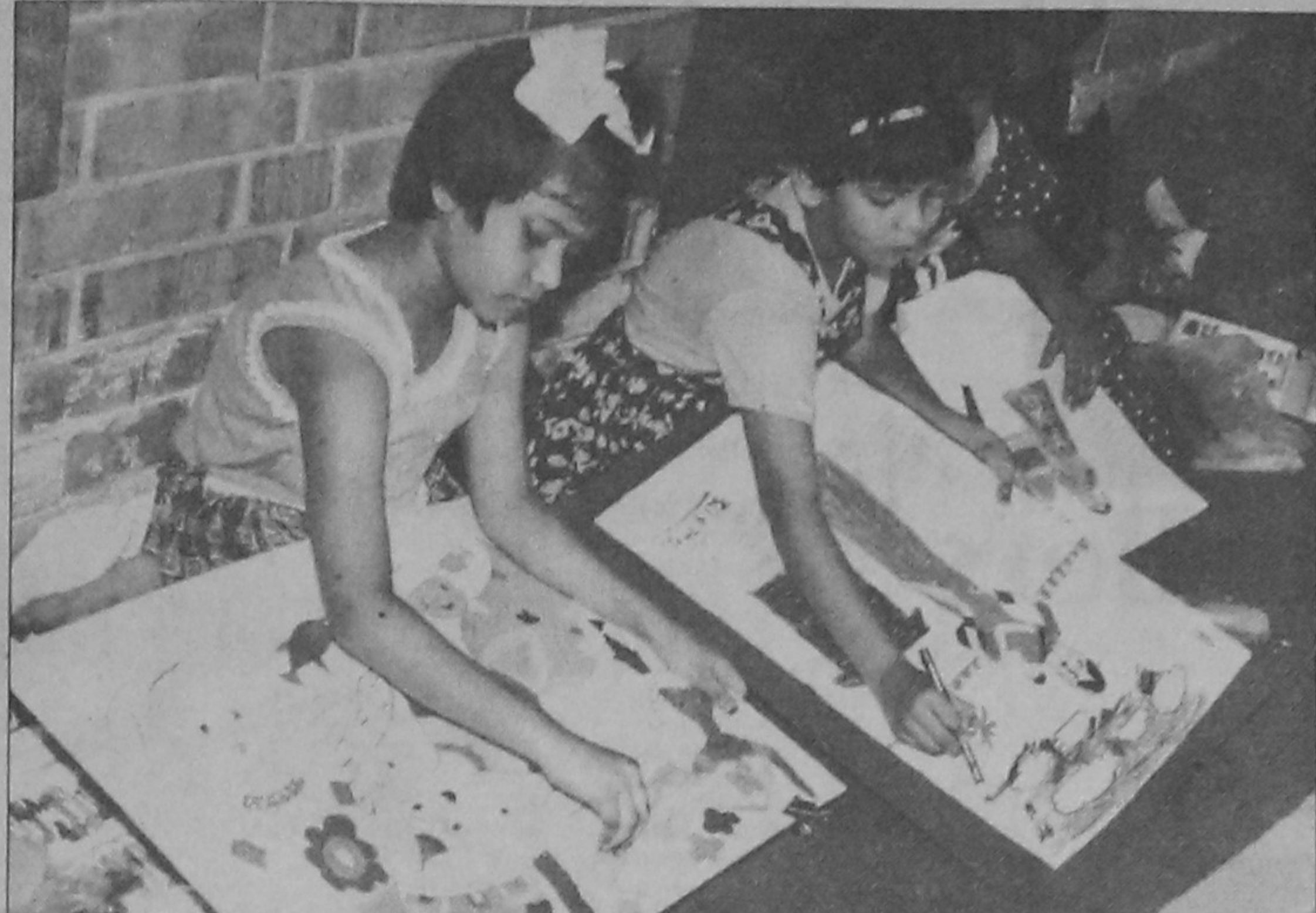
Children taking part in an international poster drawing competition, organised by UNFPA at the premises of Institute of Fine Arts in the city yesterday.