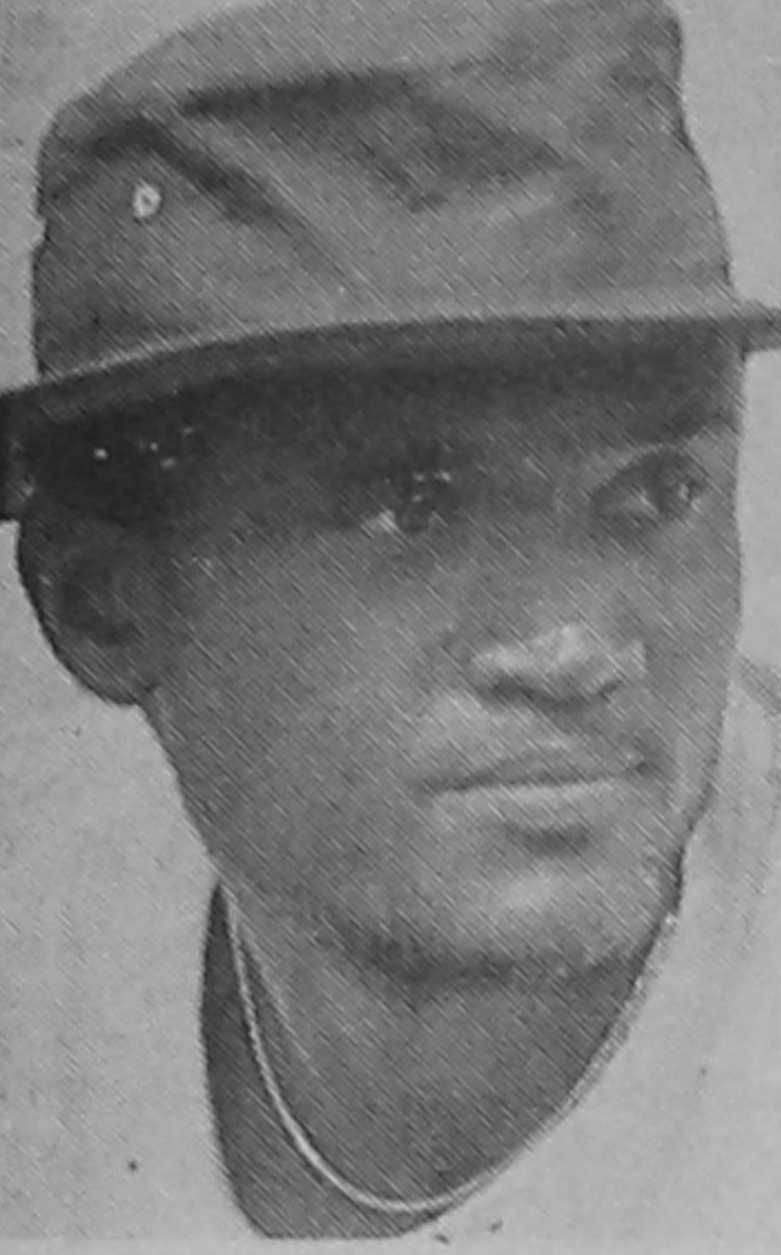
Carl Hooper (Former West Indies vice-captain)

"If the selectors feel I can play a part, then I feel I can play for another three or four years and help the youngsters come through."