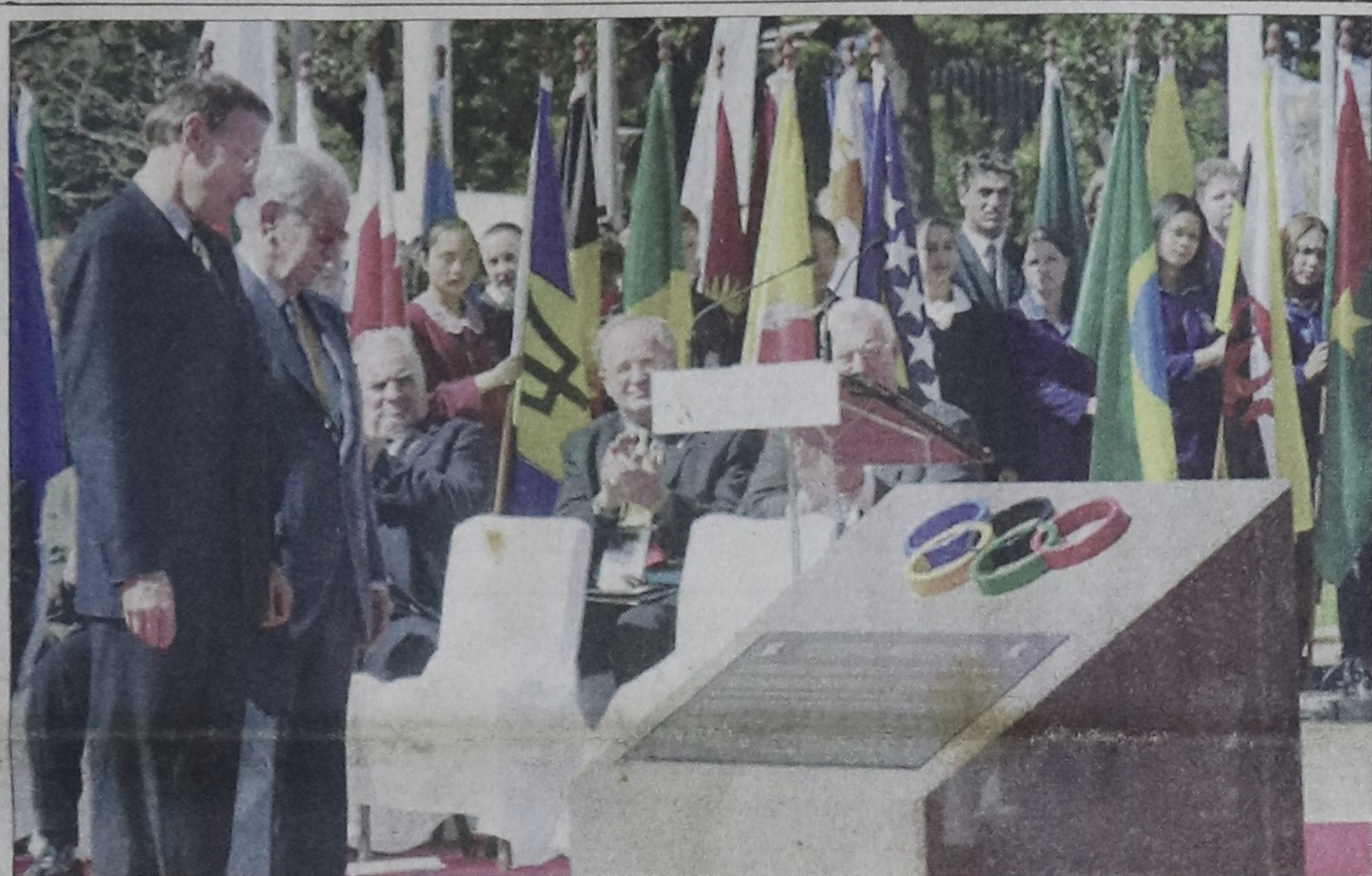
IOC President Juan Antonio Samaranch (2nd L) and New South Wales Premier Bob Carr (far L) unveil a monument yesterday in Hyde Park in Sydney during a service to honour Olympic athletes who have died in wars. The Sydney 2000 Olympic Games open September 15.

By Staff Correspondent Main opposition BNP will stage demonstrations across the country today protesting filing of 'false case' against its Chairperson Khaleda Zia, former finance minister M Saifur Rahman and former minister Abdul Mannan. As part of the programme, the party will hold a rally at Paltan Maidan in the city at 4