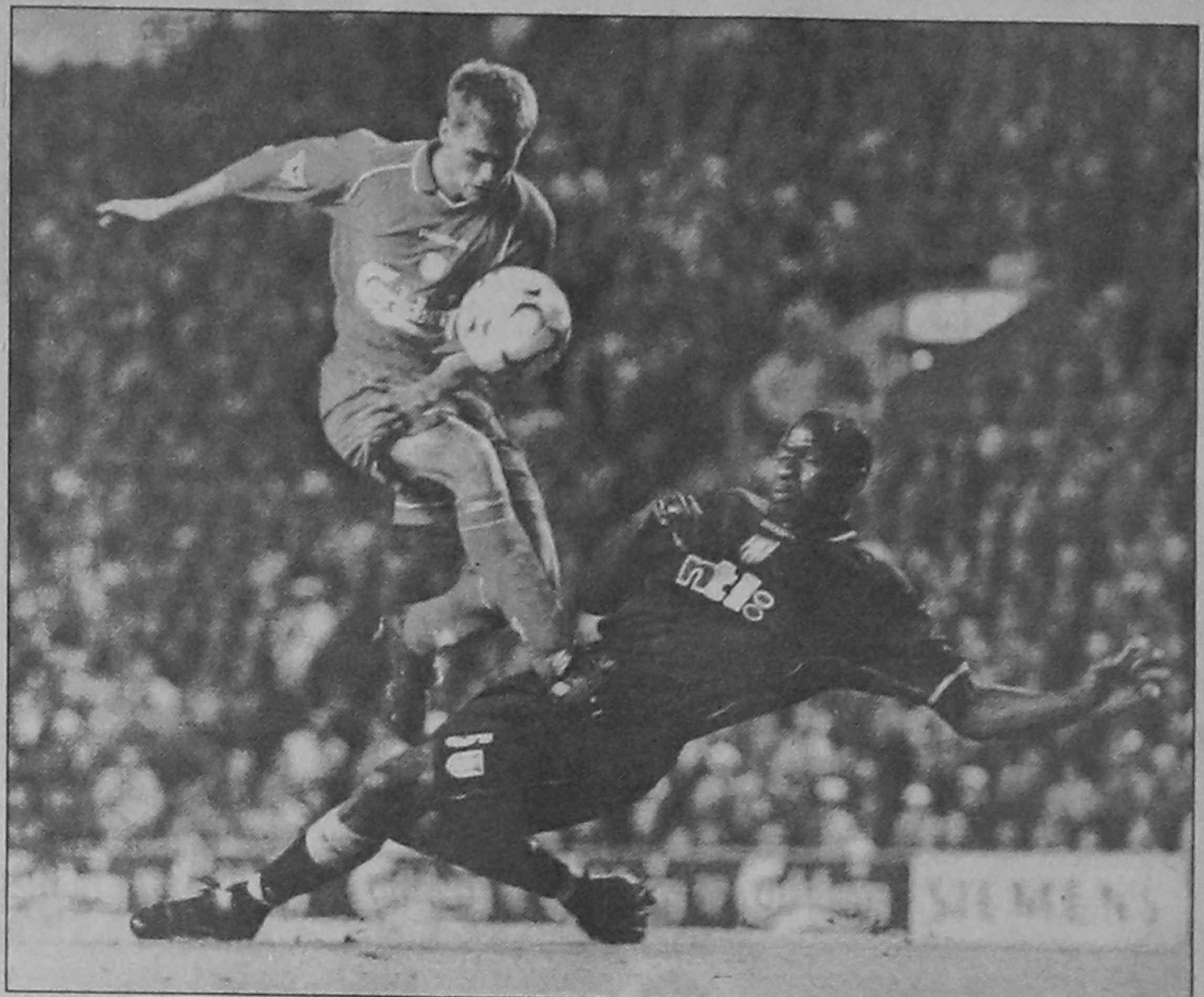
Liverpool's Michael Owen jumps to avoid a sliding tackle from Ugo Ehiogu of Aston Villa during their Premiership clash on September 6. Owen scored a hat-trick as his side won 3-1.